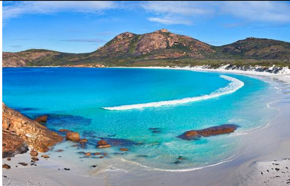
The pristine beaches of Cape Le Grand National Park.