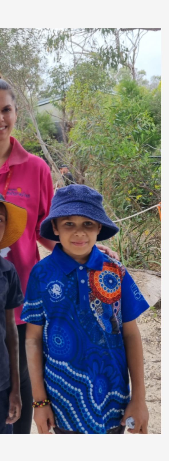
years old, meeting and ending at