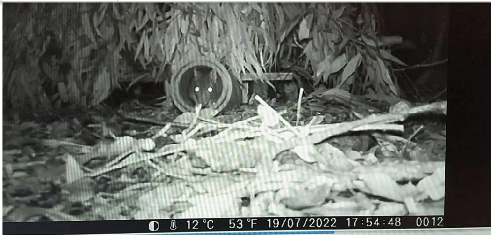
Quenda caught on camera in our bespoke 'Quenda Cabins' - refuges from introduced predators at the Perth Hills Discovery Centre

For the time being we have had to say good-bye to our Monitoring Marsupials excursion, but we are introducing an exciting new Nocturnal Fauna Monitoring program!