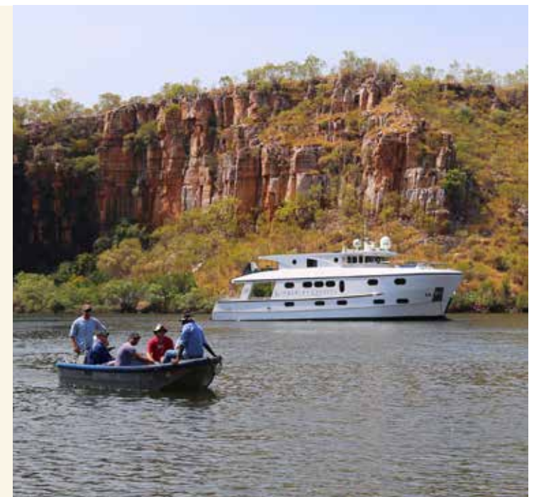
Top left: Prince Frederick Harbour in the proposed North Kimberley Marine Park.