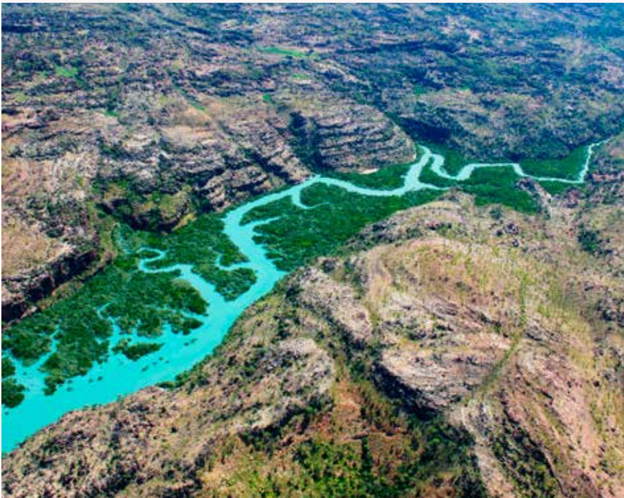
Top: Brush-tailed rabbit-rat.