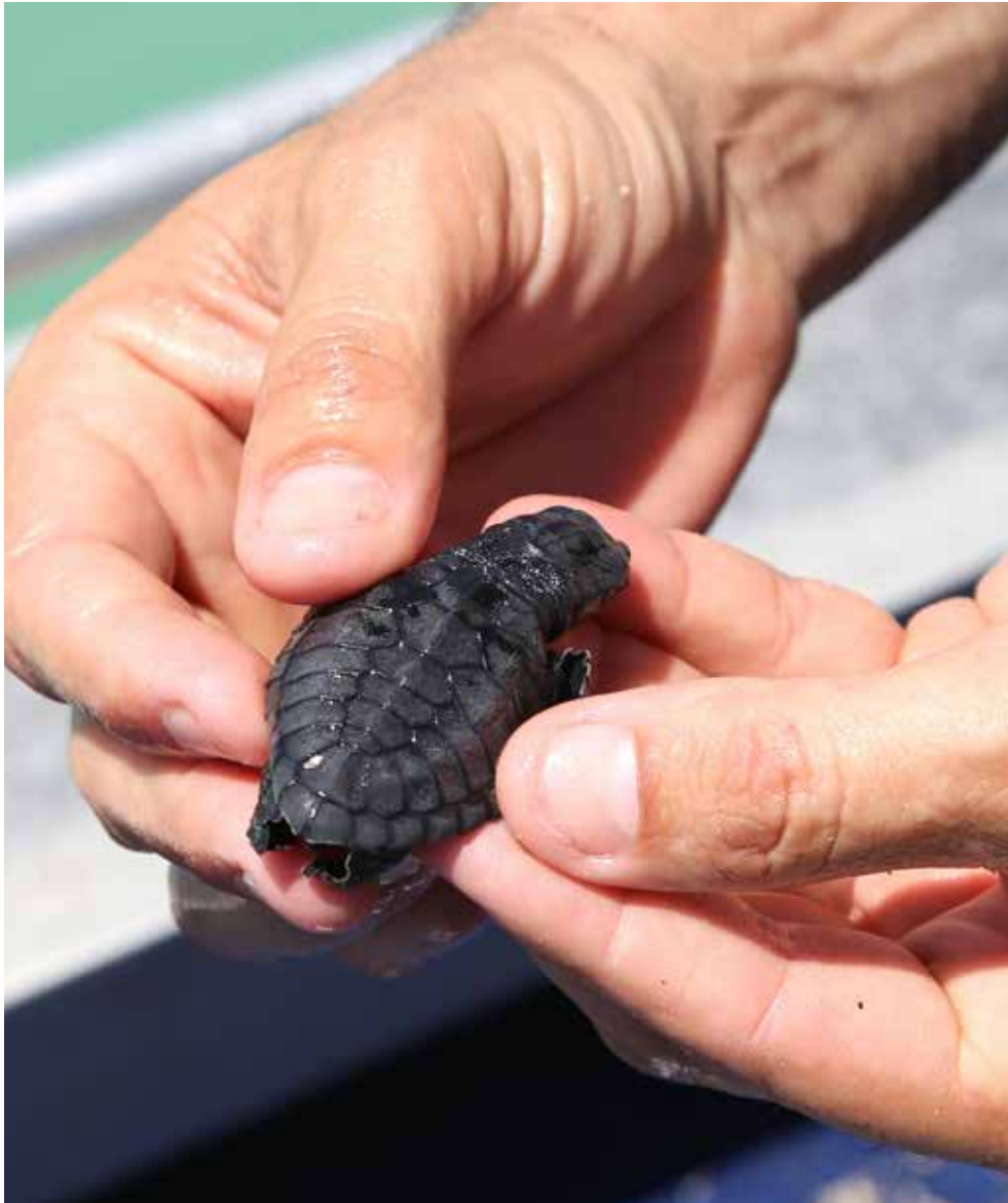
Above: Olive ridley turtle hatchling.