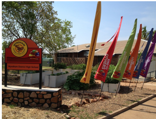
Wyndham veggie garden and 'Six Kinds of Best' banners

Teachers across the Kimberley are watching closely to see if this is something they could try in their own schools.