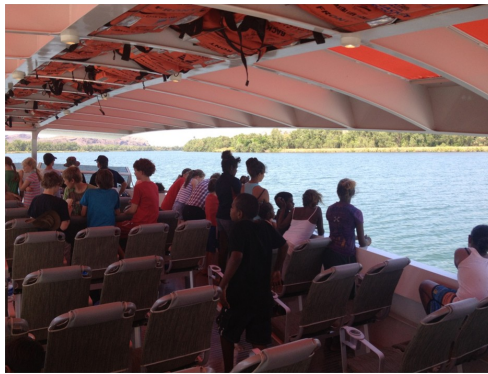
Kununurra kids spotting wildlife on a Triple J boat ride

These activities were supported by staff from Save the Children and volunteers