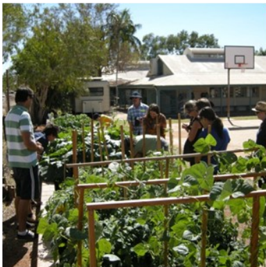
Checking out the veggie garden at Broome Primary School

Term Four has seen visits to schools across the Kimberley promoting our new cane toad resources (see the Cane Toad Update), which will be followed up with Terrible Toad incursions at a number of East Kimberley schools before the end of the year.