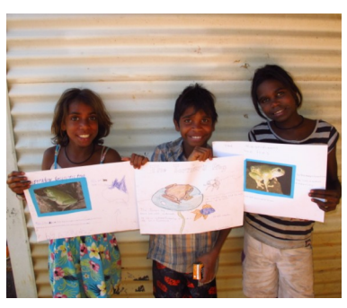
Students from Kandiwal community were the first to submit entries for the Kimberley Frogs Poster Comp.