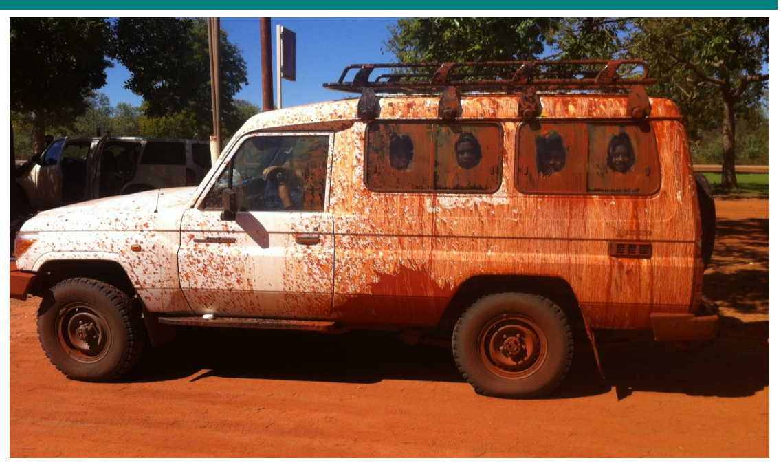
Unseasonal rain didn't stop the cadets getting to camp