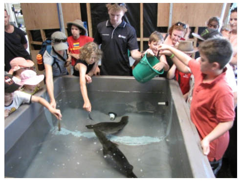
'All About Barra' in the April Holidays

Bring your camera for our Marvellous Mangroves workshop and be challenged by our photography treasure hunt! You might also want the camera for the free whale watch