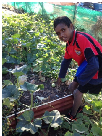
Keeping an eye on the produce

Some challenges they have faced, aside from the blazing Kimberley sun, include bulls getting into the schoolyard and eating all of the leaves from their mulberry tree, and a friendly kangaroo deciding to make their veggie patch his local snack shop and eating all the plants back to a stump. The school already has plans to work around these issues for next year.