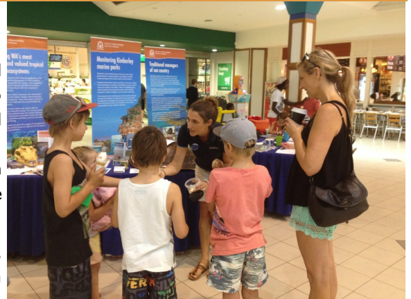
Learning about marine parks at the Boulevard

Shoppers in Broome were entertained last school holidays by a Parks and Wildlife Marine Parks display in the Boulevard Shopping Centre. In addition to information on the Kimberley Marine Parks, Yawuru Conservation Estate, and volunteering opportunities, visitors were encouraged to check out a turtle shell and eggs, a crocodile skull, and lots more. A kids table provided loads of fun with colouring in, stickers, and Marine Park Activity Books . The team will be back there on the 11-12 December, this time joined by our friends from Fisheries.