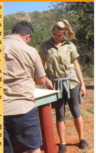
Cadets repair and repaint furniture for visitors to use at the Minyirr Park Base Camp as part of a three-day camp

For this and other projects in their local area, the Broome Bush Rangers have been recognised as the 2014 Kimberley finalist in the Tidy Towns 'Natural Environment Conservation' category.