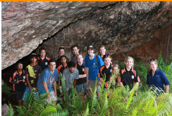
Cadets learn about biodiversity at Cave Springs

Armed with torches and identification books, the Bush Rangers discovered 24 different vertebrate and invertebrate species. Some highlights included an echidna, lots of snakes including a huge olive python, numerous frogs, bats, butterflies and spiders. The Bush Rangers were keen to compare their results with data from Parks and Wildlife surveys to learn more about the area.