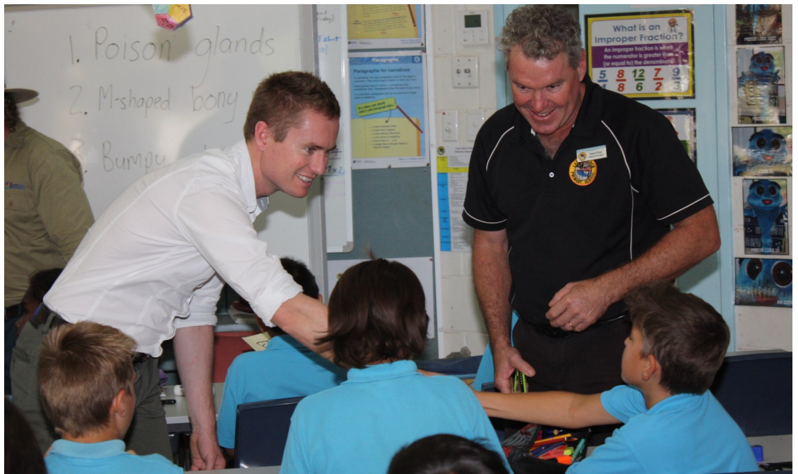
Environment Minister Albert Jacob answers cane toad questions from Cable Beach Primary School students