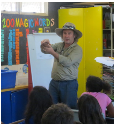
This was the first time many of the One Arm Point students had seen a live cane toad

If you're in Kununurra on 10-11 July, stop by our stall at the Kununurra Ag Show to learn all about the different kinds of work we do. It wouldn't be an Ag Show without animals, so we'll bring down some of our friends for you to meet, too.