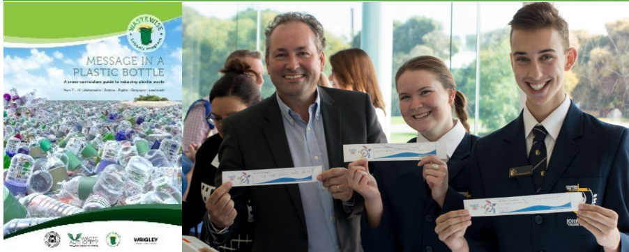
Left: the new resource for high schools. Right: Waste Authority Chair Marcus Geisler makes a plastic free pledge with students at the Message in a Plastic Bottle resource launch

Have you ever wondered what the difference between tap and bottled water really is? The new Waste Wise high school curriculum guide, Message in a Plastic Bottle , examines exactly that. Following the curriculum-linked lessons, students test for chemical differences between tap and bottled water with the provided test strips and calculate the difference in costs before developing their persuasive writing and leadership skills in encouraging their school to go plastic free.