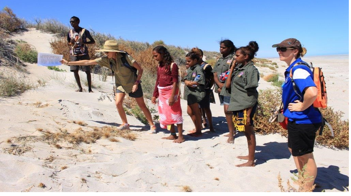
Cadets from Kalumburu determine whether or not the turtle has nested or false crawled at 80 Mile Beach Marine Park, November 2016