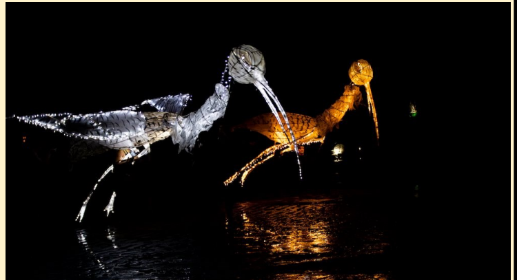
Shorebird puppets lit up the mudflats along Roebuck Bay.

The year kicked off in an exciting way with the spectacular theatre experience of the Shorebird Quest in Broome. Multiple organisations and talented people came together with local students to write, perform and create the puppets for the play which was held at Town Beach. The show celebrated the migratory shorebirds of Roebuck Bay. This gave the Yawuru rangers and the community education team the opportunity to visit Broome schools to discuss the importance of protecting shorebirds in Yawuru Nagulagun / Roebuck Bay Marine Park.