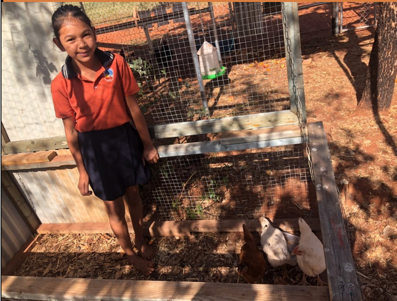
St Mary's student shows off the exciting new chicken coop.

Jen from Waste Wise Schools will be coming up at the start of Term 1 for anyone interested in learning about Waste Wise Schools and funding available to set up waste reduction initiatives in your school.