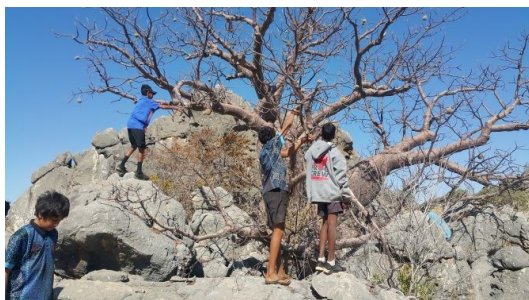
Kids at Fitzroy Valley District High School collect boab nuts for NAIDOC Week activities.