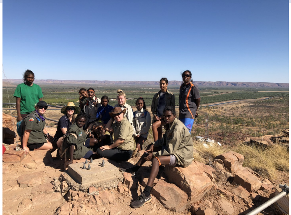
DBCA staff and Bush Ranger cadets take a break after hiking to the top of Kelly's Knob