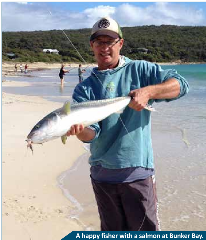
A happy fisher with a salmon at Bunker Bay.

The salmon season usually comes with the passing of the autumn equinox. Schools of this prized fish hit our local waters in abundance, to the delight of fishers. The salmon run was predicted to arrive a little later than usual this year due to warmer ocean temperatures.