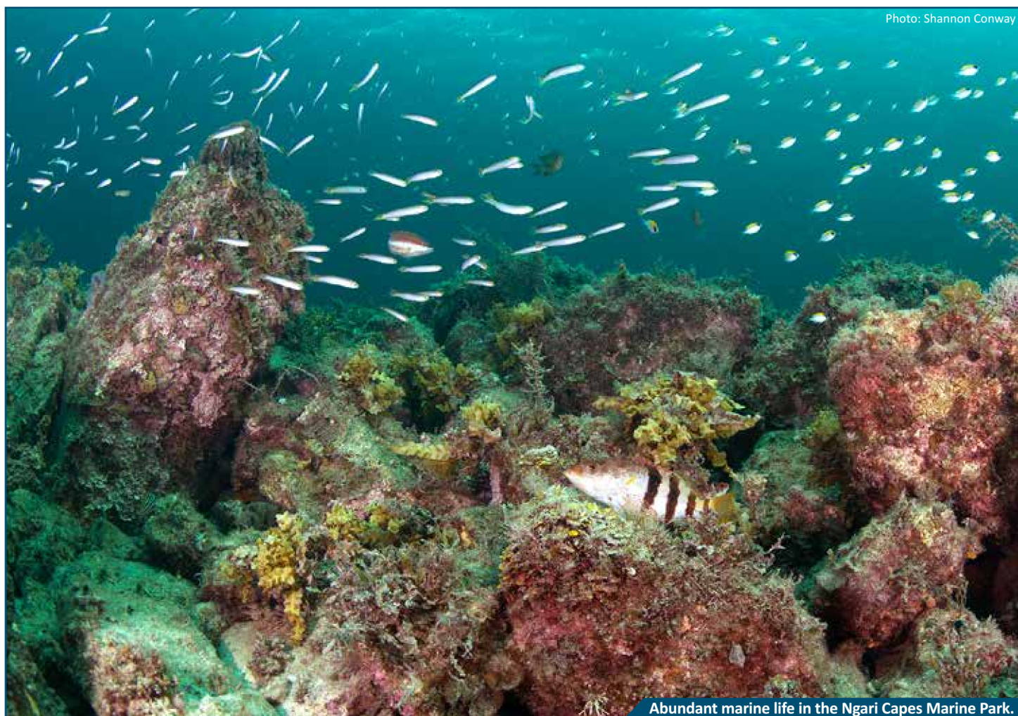
Abundant marine life in the Ngari Capes Marine Park.