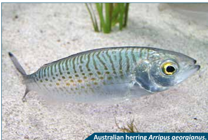
Australian herring Arripus georgianus .

After extensive consultation between the Department of Fisheries, Recfishwest and the WA Fishing and Industry Council, the daily bag limit for herring has been reduced from 30 to 12 (as of 1 March 2015). The commercial herring G-net fishery on the south coast was also closed.