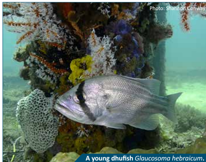
A young dhufish Glaucosoma hebraicum .