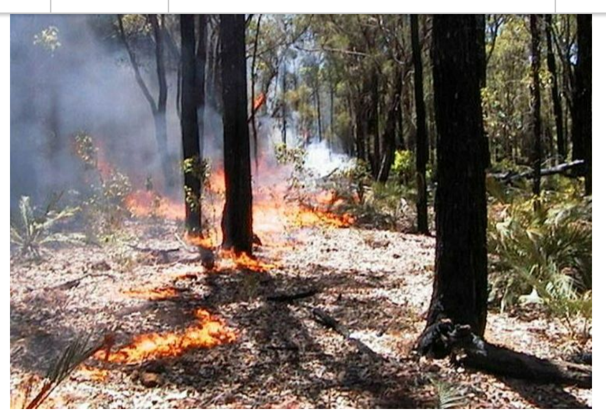
Photo: A low intensity prescribed burn protects both biodiversity and community values.