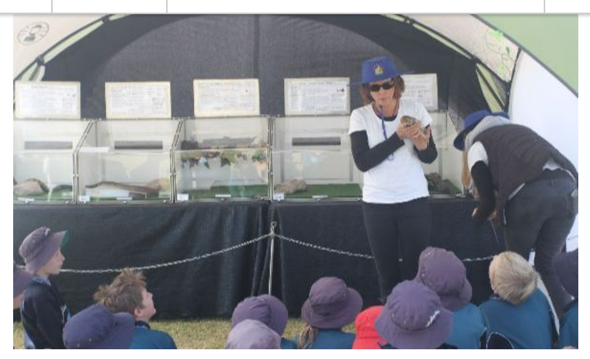
Discover Deadly brought some ssssslippery treasures to Mangrove Cove last year.