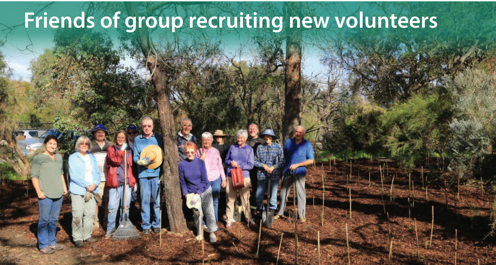
Samphire Cove Planting Day.

The Friends of Samphire Cove Nature Reserve is a group of volunteers who work alongside Parks and Wildlife and other partners to manage and improve the unique Samphire Cove 'Class A' Nature Reserve.