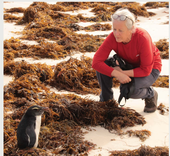
Volunteer with Fiordland penguin.

If you are interested, contact: eyre@birdlife.org.au , or for more information see the website www.eyrebirds.org