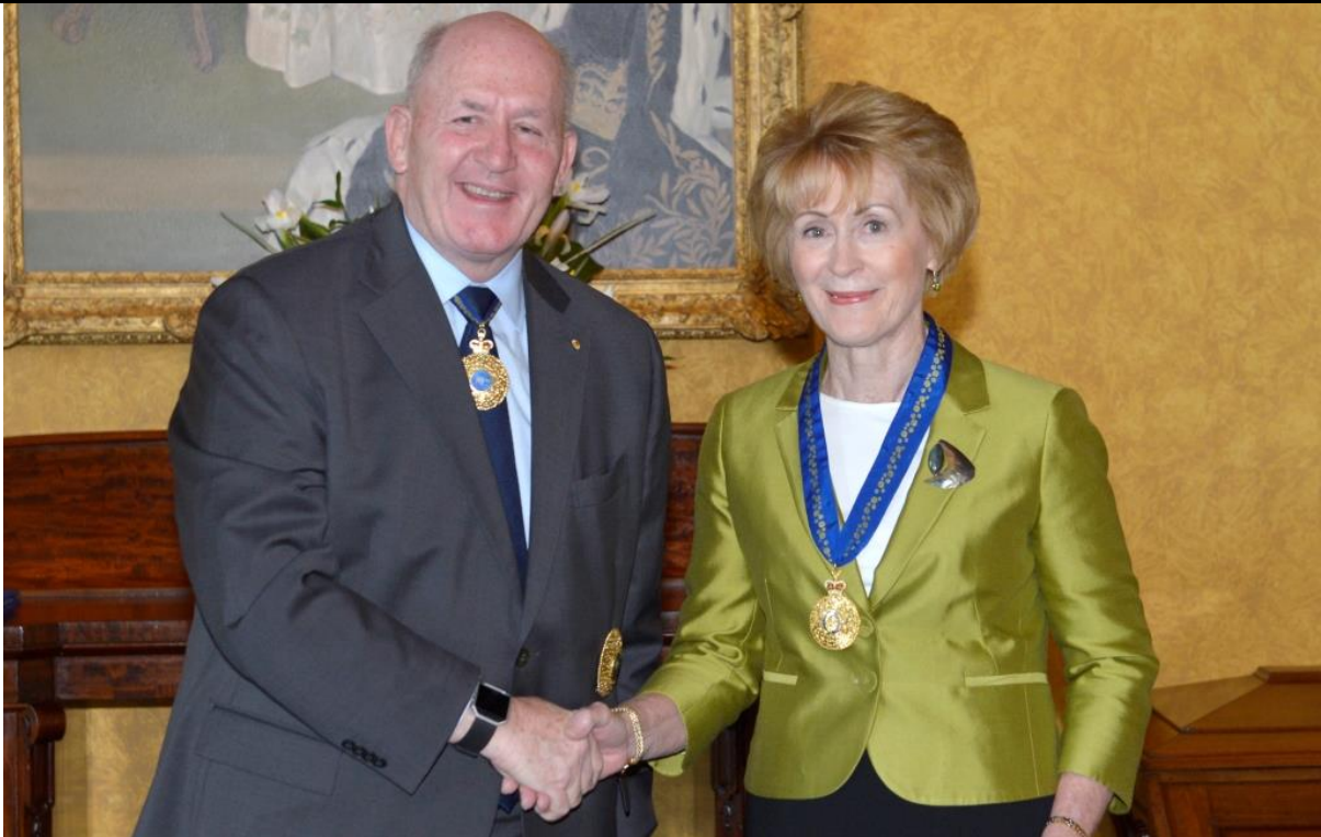
Her Excellency with the His Excellency, General the Honourable Sir Peter Cosgrove AK MC (Retd) receiving her medal