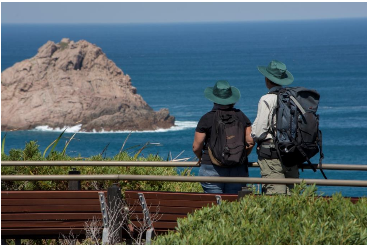
Above: Looking out at Sugarloaf Rock

Leeuwin-Naturaliste is bookended by two lighthouses - Cape Leeuwin and Cape Naturaliste, which give the park its name. The rugged coastline stretches 120 km from the north at Bunker Bay to the south at Augusta. The park is known for its eye-catching granite formations and iconic features such as Sugarloaf Rock and Canal Rocks.