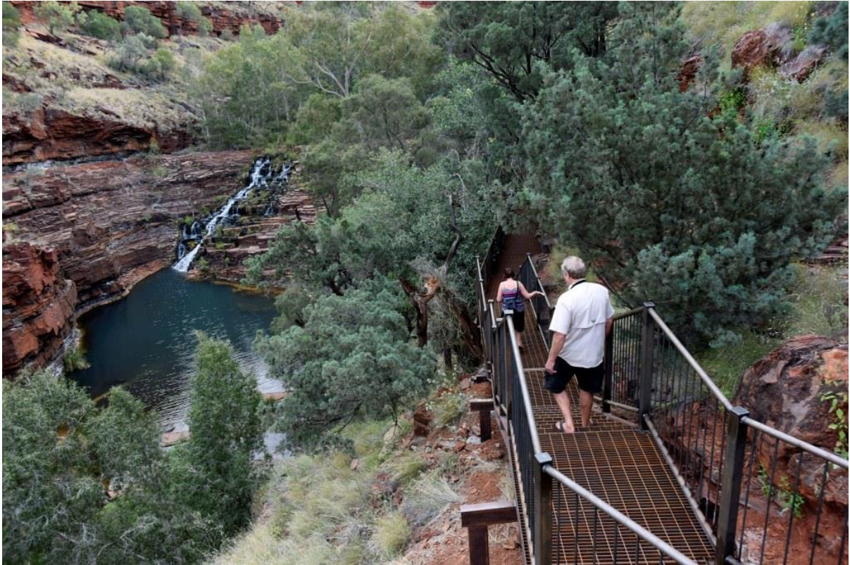
Visitors descend the stairs into Dales Gorge to enjoy the stunning Fortescue Falls