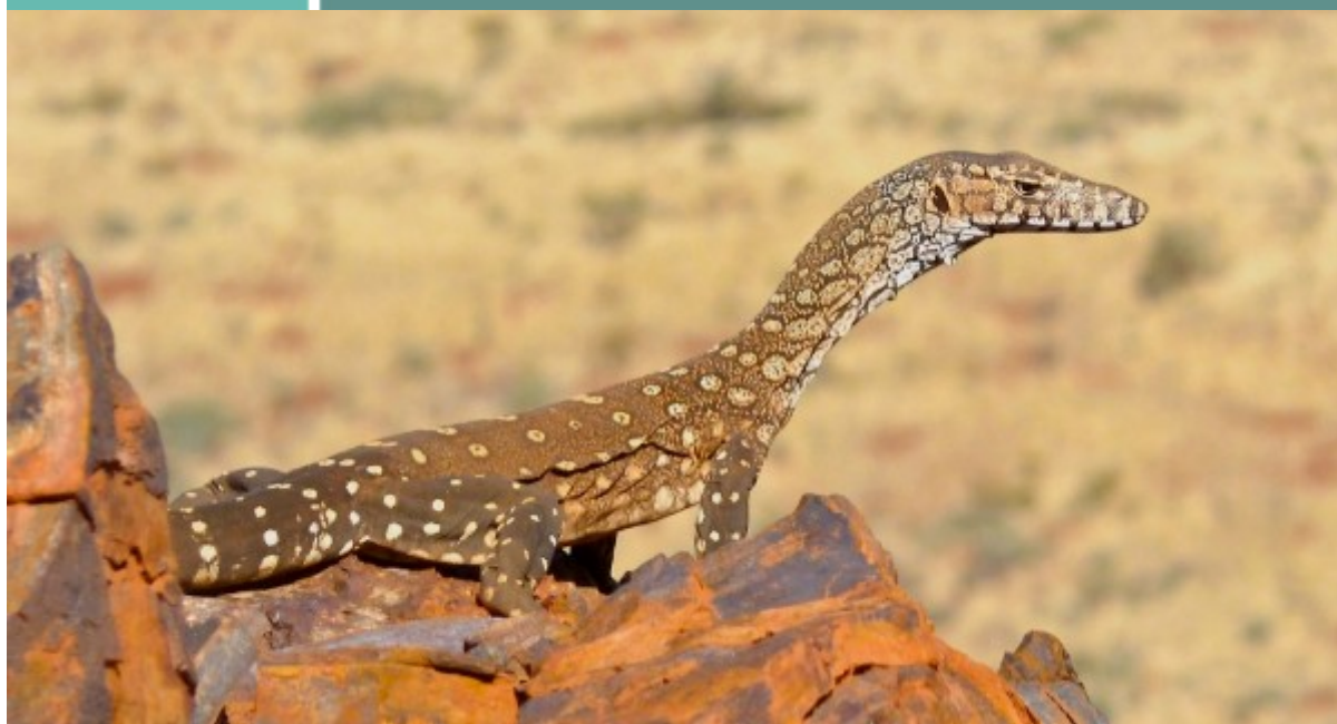
Perentie monitor (Varanus giganteus), Karijini National Park.

Uniting the community to protect our natural areas