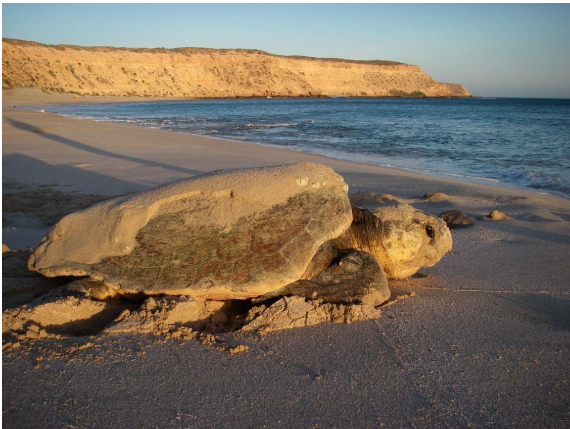
Top Cape Inscription Lighthouse. Above Loggerhead turtle after nesting.