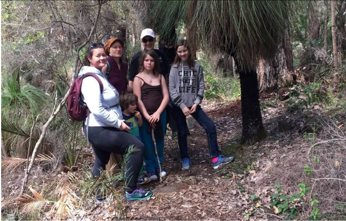
The first bushwalk on 16 October.

And so the Peel Bush Walks and Adventures was born; where teenagers and their families are encouraged to leave their home and discover the beauty of the region's countryside while enjoying the health benefits of exercising in nature.