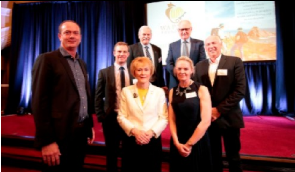
Inaugural WA Parks Foundation Board members