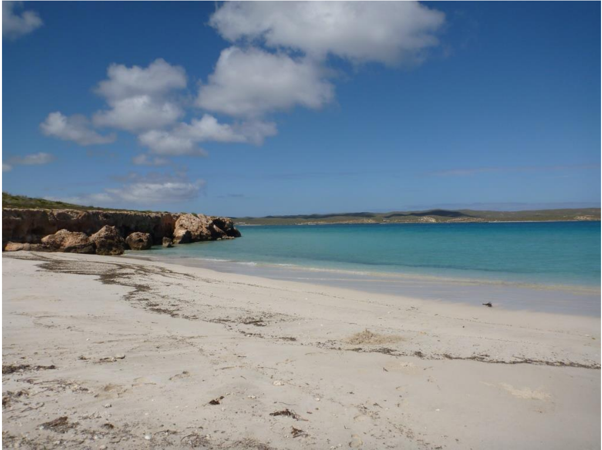
Above Cape Rasonnet

Four hundred years ago in October 1616, Dirk Hartog made the first recorded landing by a European in WA and now plans are underway to restore the island's natural ecosystems to how Dirk Hartog would have seen them, with thriving native mammal populations. Restoration was necessary because intense grazing and trampling by sheep and goats denuded the island's vegetation and, combined with feral cats, had earlier exacted a hefty toll on the island's small mammal population.