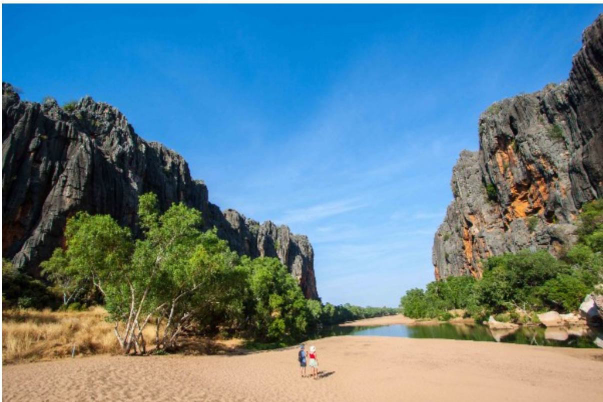
Windjana Gorge National Park.

Welcome to the 12th issue of WA Parks Foundation News , where you can share your love for our WA Parks with us as we aim to increase community appreciation and involvement in the conservation of the State's national parks and conservation reserves.