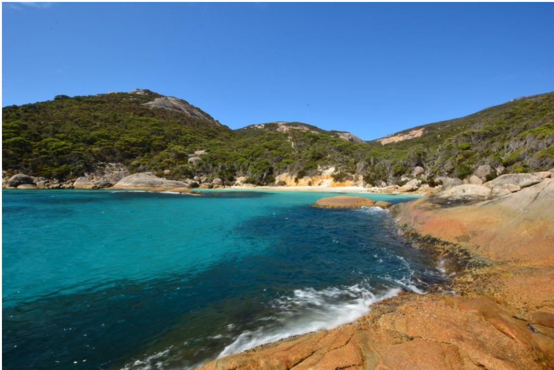
Two Peoples Bay Nature Reserve.