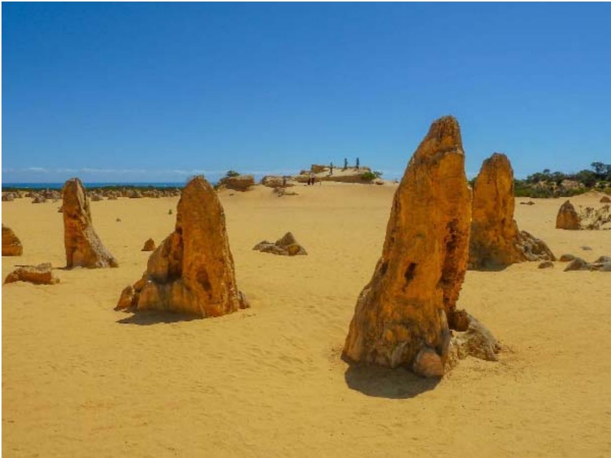
The Pinnacles in Nambung National Park

Welcome to the 13 th issue of WA Parks Foundation News , where you can find updates on the progress of the WA Parks Foundation, which aims to increase community appreciation and involvement in the conservation of the State's national parks and conservation reserves.