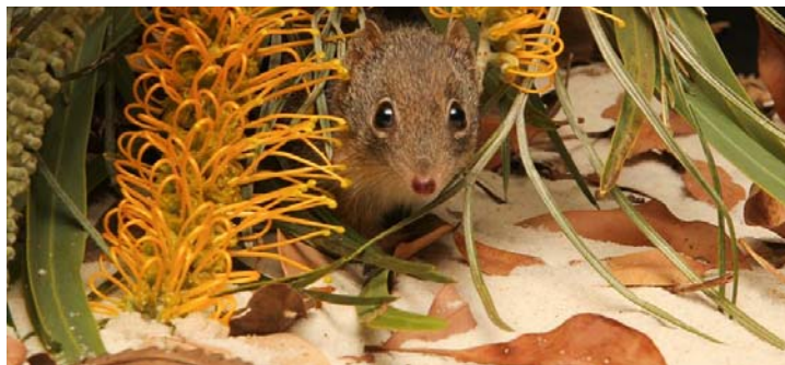
Picture: Dibblers are very agile animals and often climb bushes to lick nectar from flowers | Credit: Perth Zoo

The Dirk Hartog Island National Park about 850 kms north of Perth has welcomed some adorable new residents. Twenty-four endangered dibblers bred at Perth Zoo were released to the island in October by staff from the Department of Biodiversity, Conservation and Attractions.