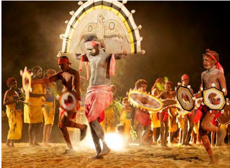
Picture: The World indigenous Tourism Summit theme is: Tourism and Indigenous Earth Wisdom Weaving the Future that Benefits All

Perth is preparing to host the World Indigenous Tourism Summit from 6 to 9 April. The event will bring together participants from throughout Australia and overseas to discuss economic, environmental, social and political advances and challenges in Indigenous tourism.