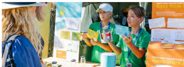
Picture: Changing Your World Youth Conference

During the very successful Spring into Parks program in 2019, the WA Parks Foundation partnered with Millennium Kids on two events at Burra Rock Conservation Park near Kalgoorlie. The Kids on Country team shared their stories, explained local plants, cooked damper and guided visitors around this site within the Great Western Woodlands