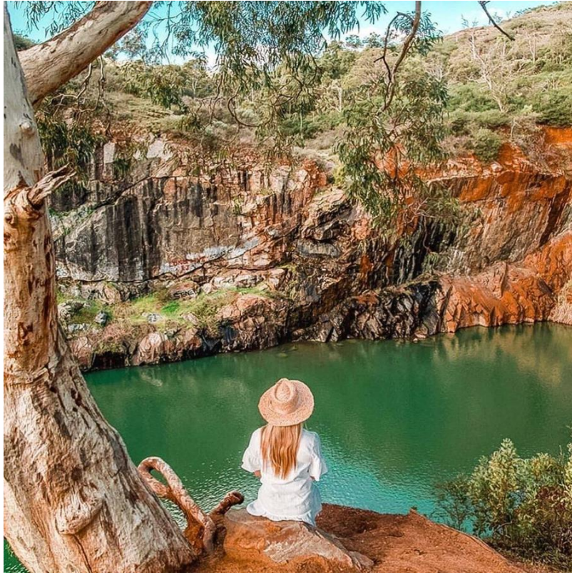
Ellis Brook Valley Reserve, The Hike Collective