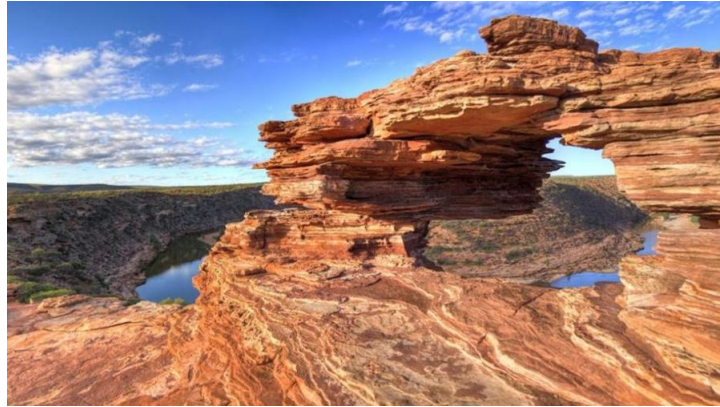
Nature's Window, Kalbarri National Park

The Smart Park mapping program initiated by the WA Parks Foundation has taken another step forward with the launching of three maps to help maximise the experience of a visit to Kalbarri National Park.