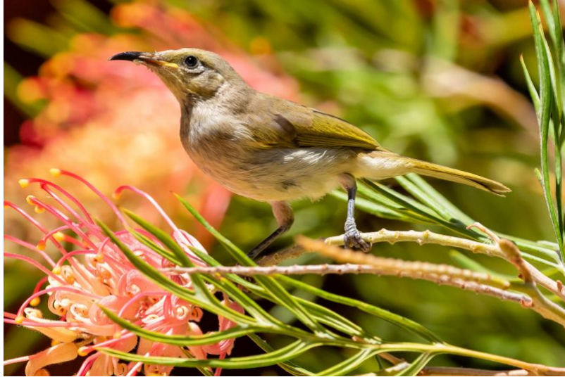
Brown Honeyeater, Geoff Ball

Birdlife Australia's third annual Photography Awards competition is open for entries until 3 August. There are nine main categories including the Portfolio prize and a Youth category for entrants under the age of 18 years. While most of the old favourites are returning, there are two new categories: Backyard Birds and Birds in Flight.