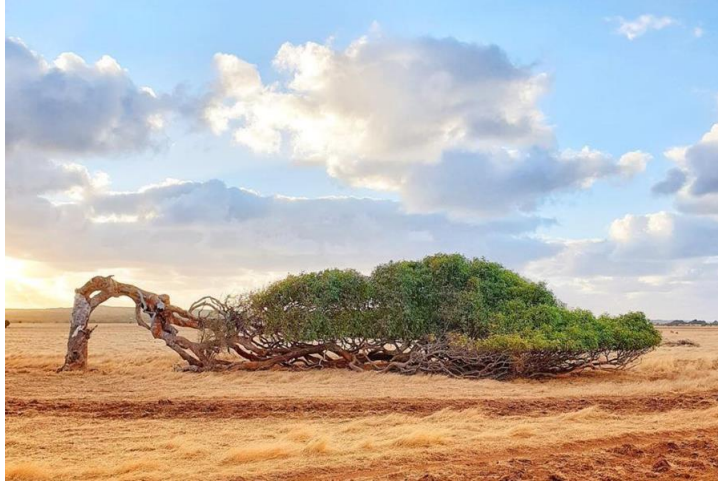
Wind buffeted Red River Gum at Greenough, Coral Coast

Sharing inspiring and engaging videos has been a popular activity for many during the Covid-19 pandemic.