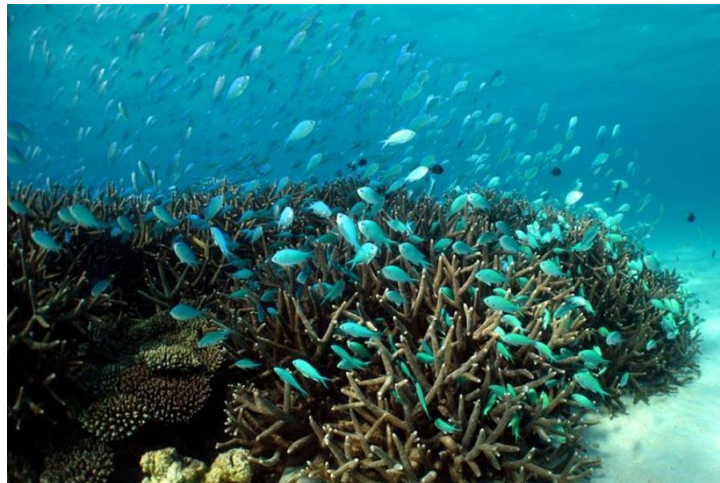
Ningaloo Reef, WA Coral Coast

What will our world heritage Ningaloo Reef look like in 2040? How can we strengthen the reef and community to be able to adapt to current and future threats? How do we balance the conservation and enjoyment of the reef with building a more diverse and sustainable local economy?