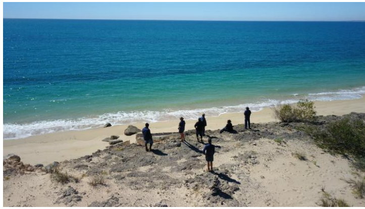
Gourdon Bay in the Kimberley region

A grants program designed to support Australian Aboriginal people and organisations in WA in renewing links between community, Country and culture is open for applications.