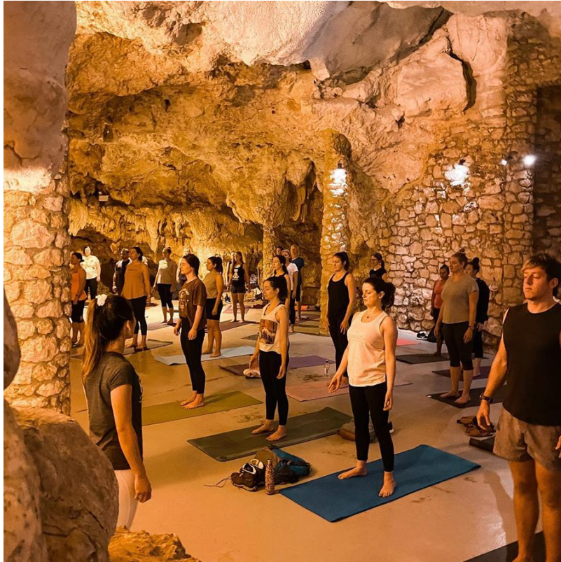
Yoga and Mindfulness in Yanchep National Park's Cabaret Cave

Unleashing your inner Wilderness Warrior is the theme of the current Spring into Parks program, with a wide range of events and activities throughout October and November 2020. The WA Parks Foundation has sponsored several events in this campaign.