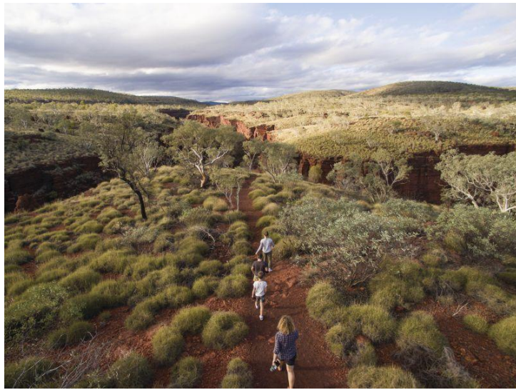
Karijini National Park

The WA Parks Foundation's 2020 Hidden Corners community photo competition has attracted great interest, with a stunning array of images submitted by talented amateur snappers.