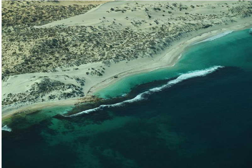
Ningaloo Coast

Almost 50,000 hectares of new conservation and recreation reserve has been created along the Ningaloo Coast. This area, one of Western Australia's premier tourism destinations, has a diversity of marine and terrestrial wildlife and many cultural sites.