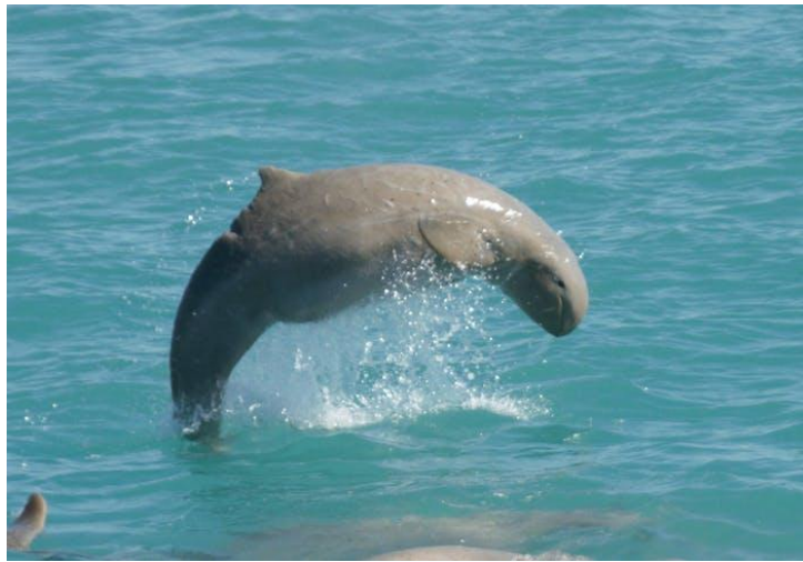
Australian snubfin dolphin