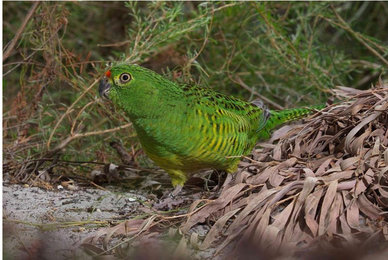
Western Ground Parrot

In a meticulously planned operation, scientists and volunteers have translocated a number of critically endangered Western Ground Parrots to a new location in the State's lower southwest.