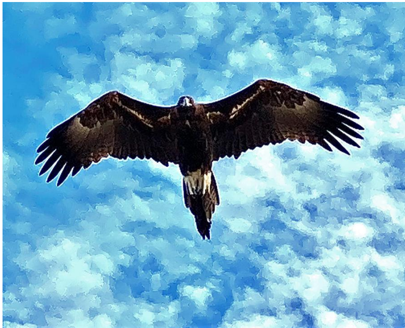
Wedge-tailed Eagle, Rosemary Island

The Wedge-tail eagle is Western Australia's largest bird of prey. This huge bird has a wingspan of up to 2.84 metres and soars with ease, circling at great heights.