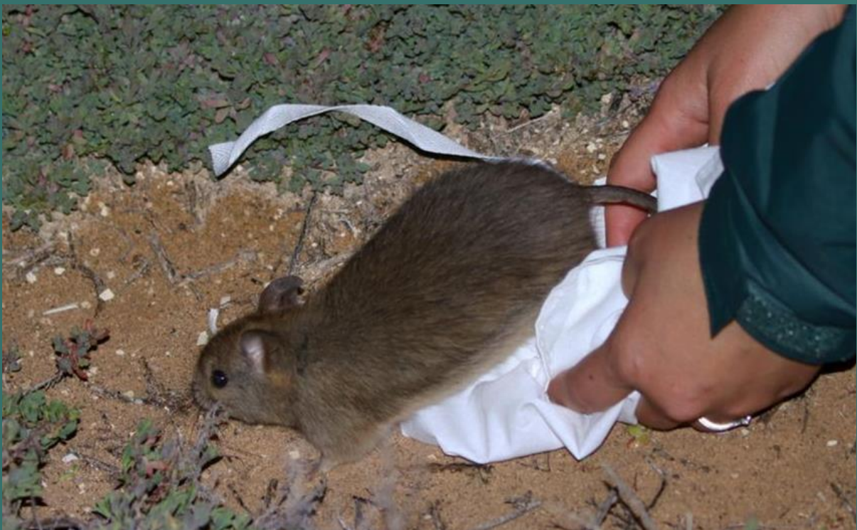
Greater stick nest rat being released on Dirk Hartog Island.

New native animal populations that have been returned to Dirk Hartog Island are reported to be doing well. Above average winter rainfall over the last two years has been helpful, promoting good plant regeneration, food and shelter.