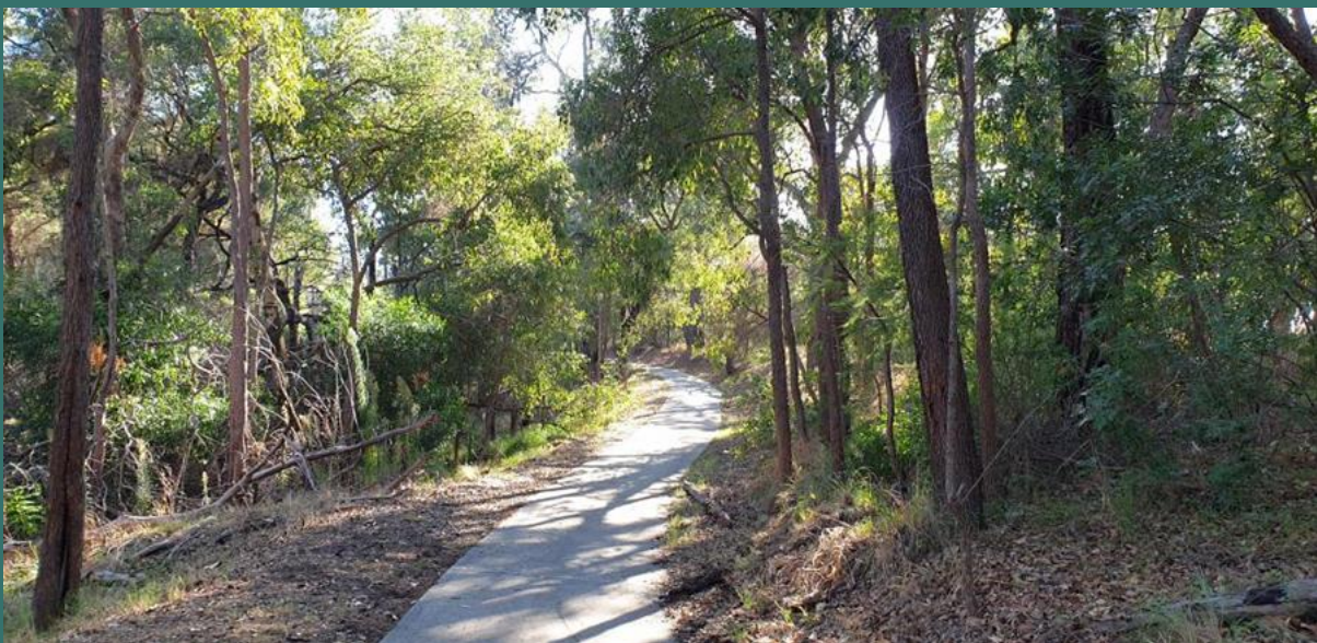
Foreshore reserve, Southern and Canning rivers confluence.

Perth's Swan and Canning river systems will benefit from a major revegetation initiative to improve foreshore conditions.