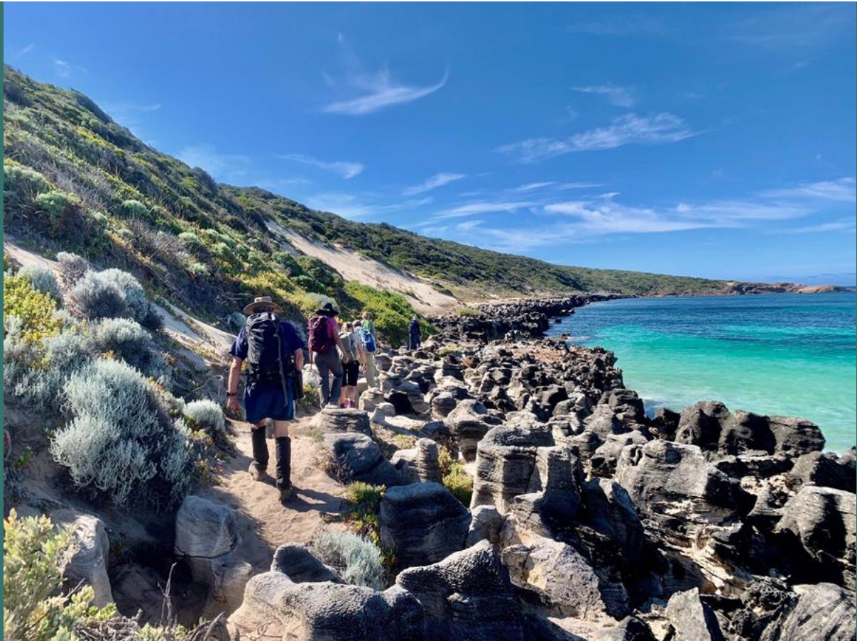
Hiking the Cape to Cape | Photo credit: Cape to Cape Explorer Tours

Major improvements are planned for the Leeuwin-Naturaliste National Park in the State's south west.