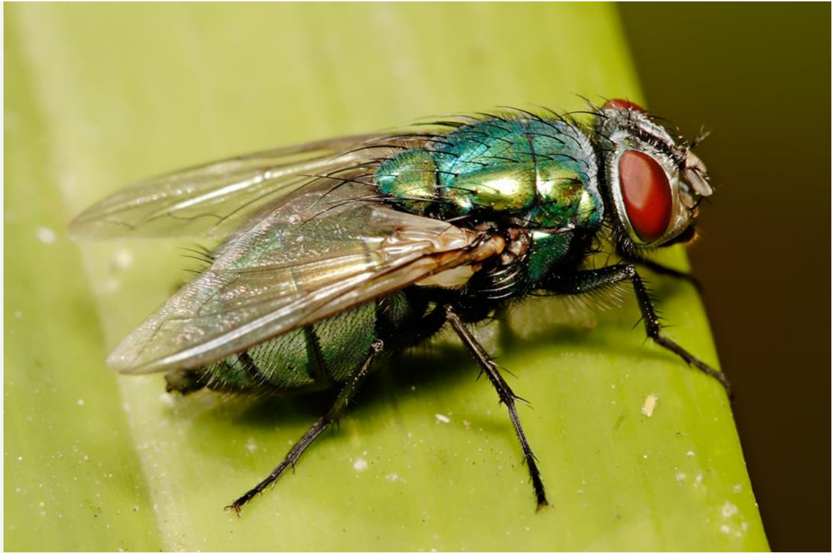
Australian blow fly

Curtin University researchers have collected iDNA (invertebrate-derived DNA) from carrion flies to track the movements of native species across WA's wheatbelt, with hope to improve future conservation efforts in the region.