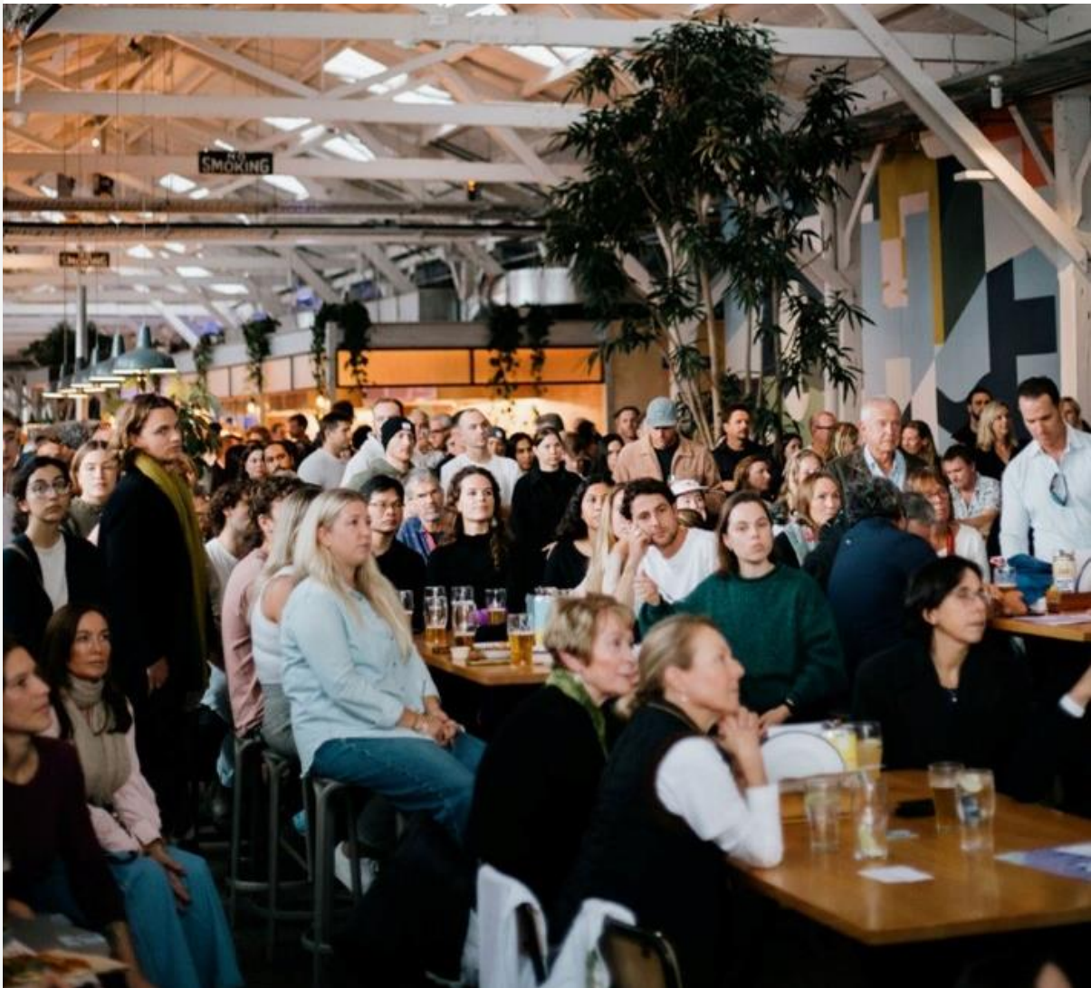
World Oceans Day at Gage Roads, Victoria Quay, Fremantle