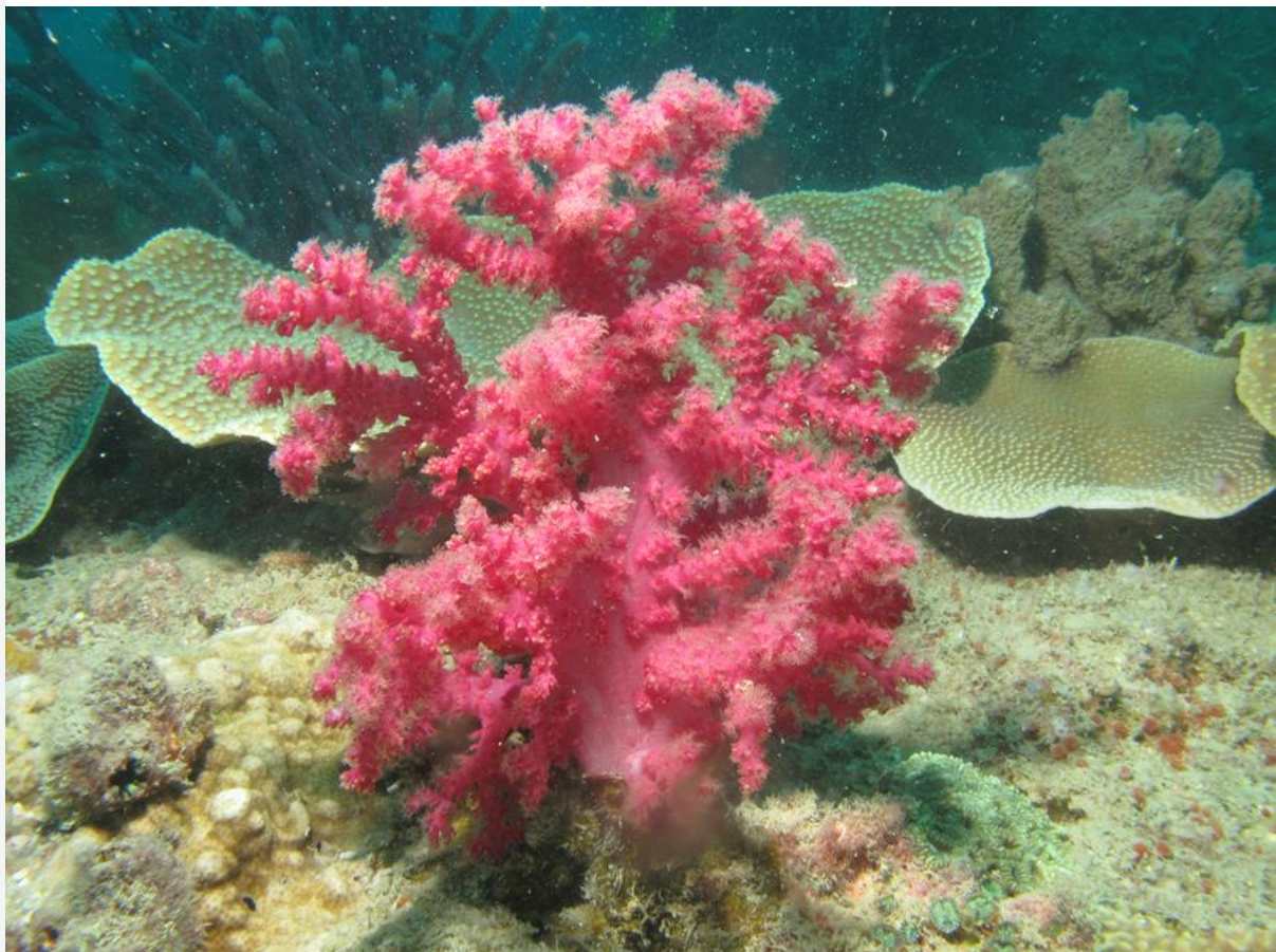
Kimberley soft coral.