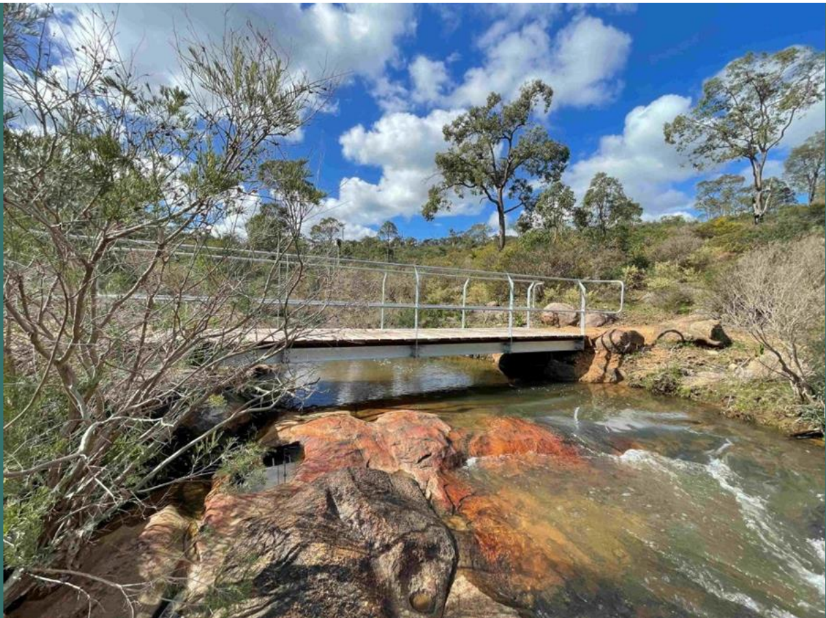
A bridge across Glen Brook.

Western Australia's first and very popular national park, the John Forrest National Park in Mundaring, is receiving some long-awaited upgrades with projects designed to bring its facilities up to a higher standard to improve the visitor experience.