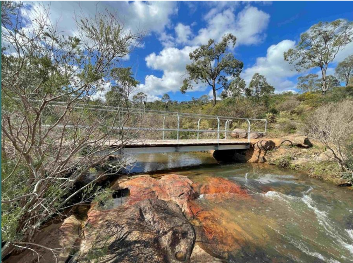
A bridge across Glen Brook.

Western Australia's first and very popular national park, the John Forrest National Park in Mundaring, is receiving some long-awaited upgrades with projects designed to bring its facilities up to a higher standard to improve the visitor experience.