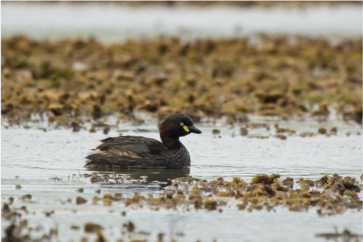
Australasian Grebe, Bibra Lake Reserve.

Bibra Lake is a part of the Beeliiar Wetlands chain and a large number of bushbirds and waterbirds can be seen here. Over 130 bird species have been recorded in this reserve.