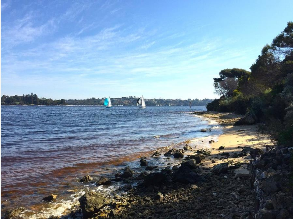
Point Resolution foreshore, Dalkeith.

Local governments will share in up to $850,000 in funding as part of the latest round of Riverbank grants.