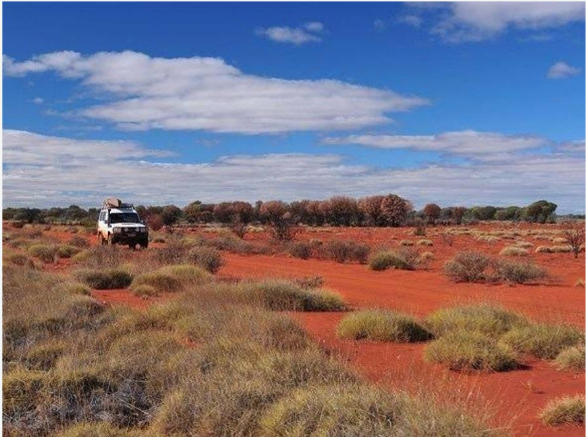
Collier Range National Park.

A new national park has been created in the Mid West-Gascoyne region. The Jilgu National Park spans 102,000 hectares of scenic mulga country interspersed with rugged hills and watercourses.