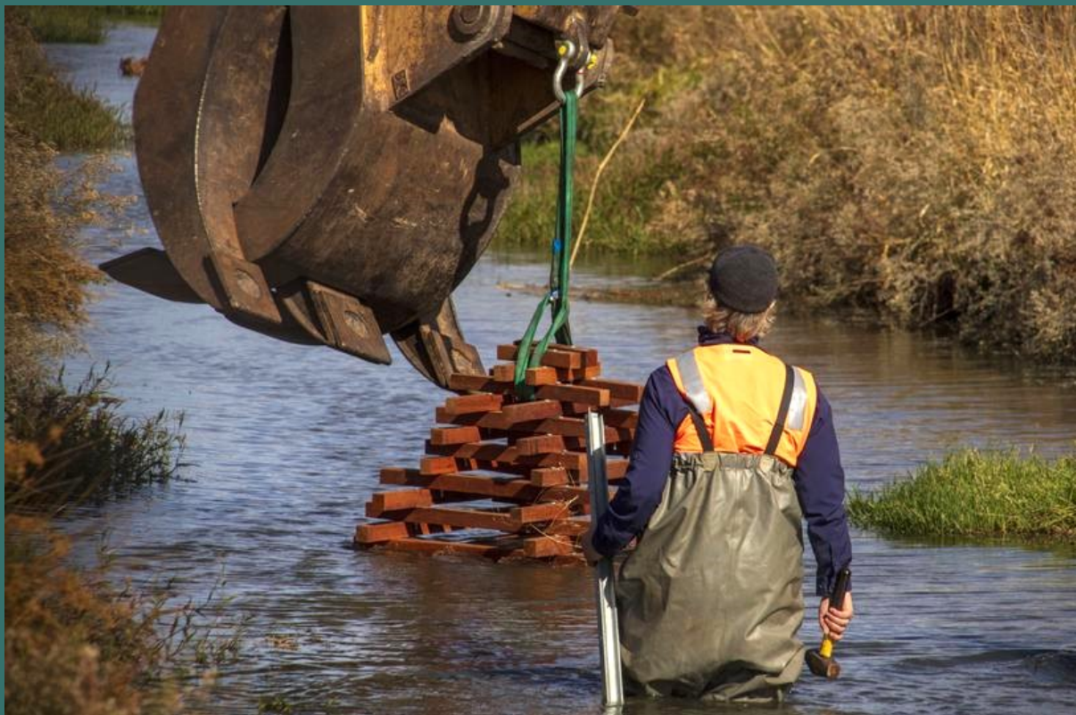
Fish hotel being installed in the Harvey River.

An innovative new project to breathe life into the Harvey River involves the installation of nine 'fish hotels' designed to provide habitat and protection for native aquatic species.