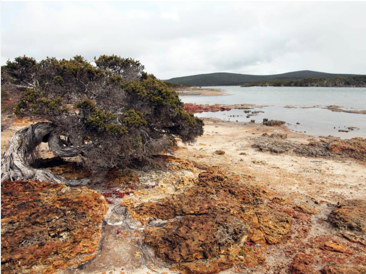
St Mary Inlet, Fitzgerald River National Park.