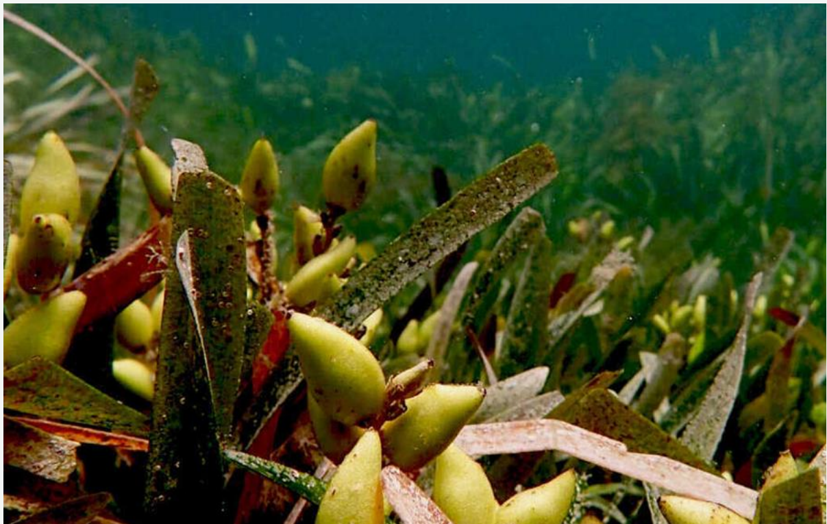
Posidonia seagrass fruit.

Seeds for Snapper, Australia's largest community-driven seagrass restoration project, was a finalist in the Science Engagement of the Year category of the 2024 Premier's Science Awards.