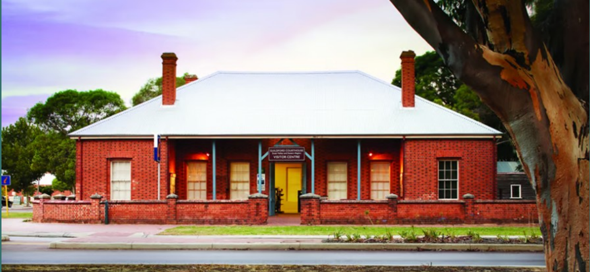
Swan Valley Visitor Centre.

Western Australia has once again proven itself a shining star in the tourism industry, earning accolades at the prestigious Qantas Australian Tourism Awards. With thirteen medals, the State showcased its diverse and world-class offerings.