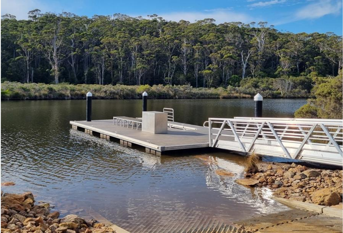
New ramp facilities at Nornalup Jetty.

Upgrades have been completed at the WA's Valley of the Giants and the Walpole and Nornalup Inlets Marine Park as part of a State funded program to make regional tourism attractions in the South West more accessible.