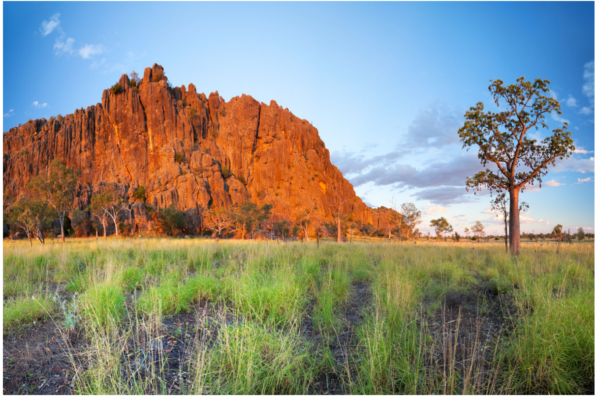
Windjana Gorge in the Kimberley

Winter is here and its cold outside, but if you are looking to beat the chill you don't have to go far.