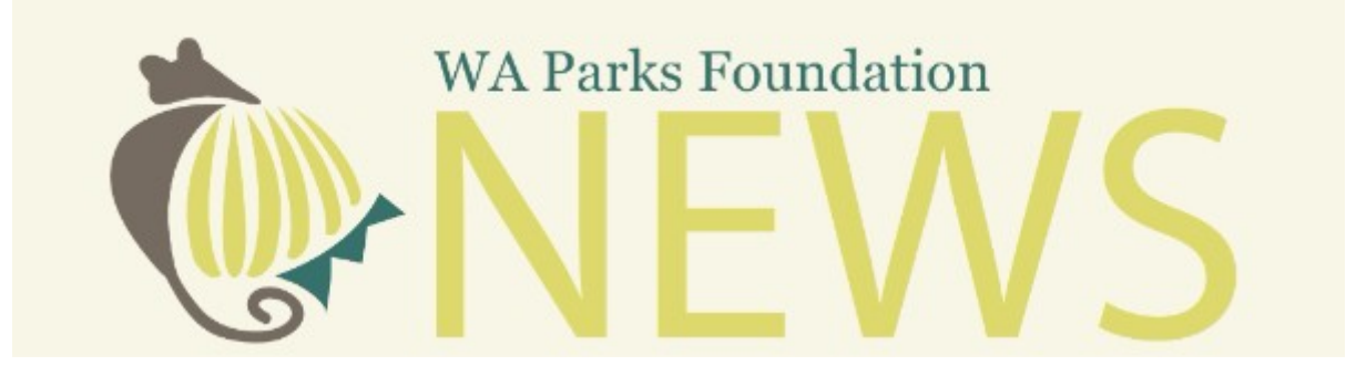
Issue 26, July 2018