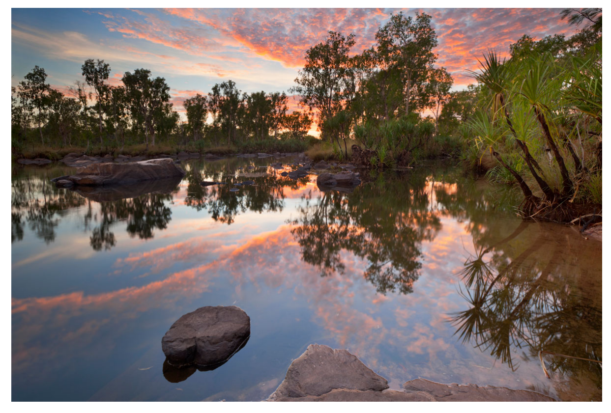
Escape north this winter and experience one of the Kimberley's amazing national parks.

Welcome to the WA Parks Foundation News, where you can find updates from the WA Parks Foundation. Our aim is to celebrate our WA Parks and work to increase community appreciation and involvement in the stewardship of our incredible national parks and conservation estate.