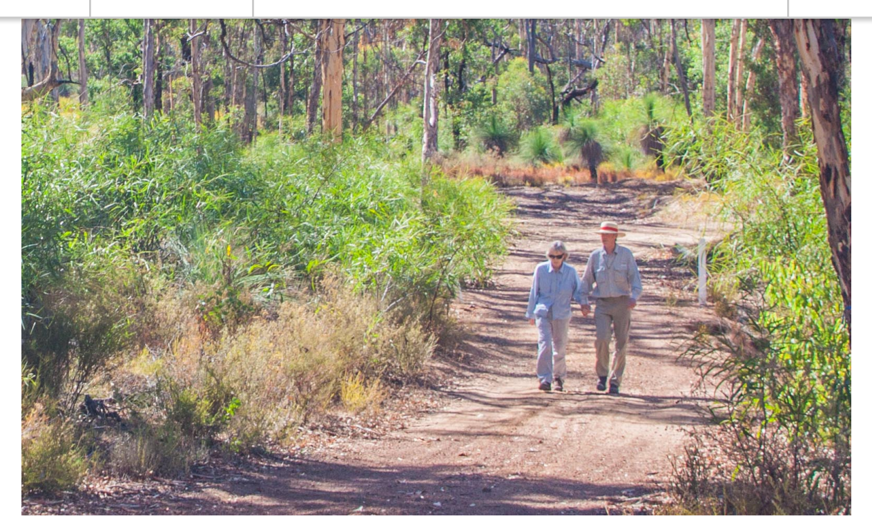
Bushwalking through Julimar Forest on the Pilgrim Trail.

Whether you live in Perth or in regional Western Australia, there are amazing parks right on your doorstep. Every month we feature a national and urban park, encouraging you to take a trip and visit a park you have never been too before. We've featured parks from across WA, including <u>Mirima National Park</u>, <u>Rockingham Lakes Regional Park</u>, <u>Baigup Wetlands</u>, <u>Torndirrup National Park</u> and <u>Herdsman Lake Regional Park</u>.