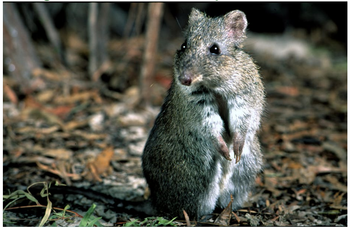
Gilbert's Portoroo

Two trial translocations for a rare marsupial have shown promising results, according to the <u>Department of Biodiversity</u>, <u>Conservation and Attractions</u>.