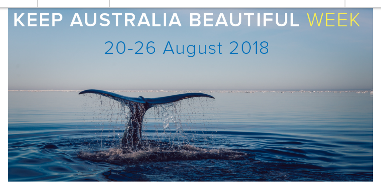
Help keep our water litter free this August

Keep Australia Beautiful Week is held late August each year, to raise awareness about the simple things we can all do in our daily lives to reduce our impact on the environment and encourage action.