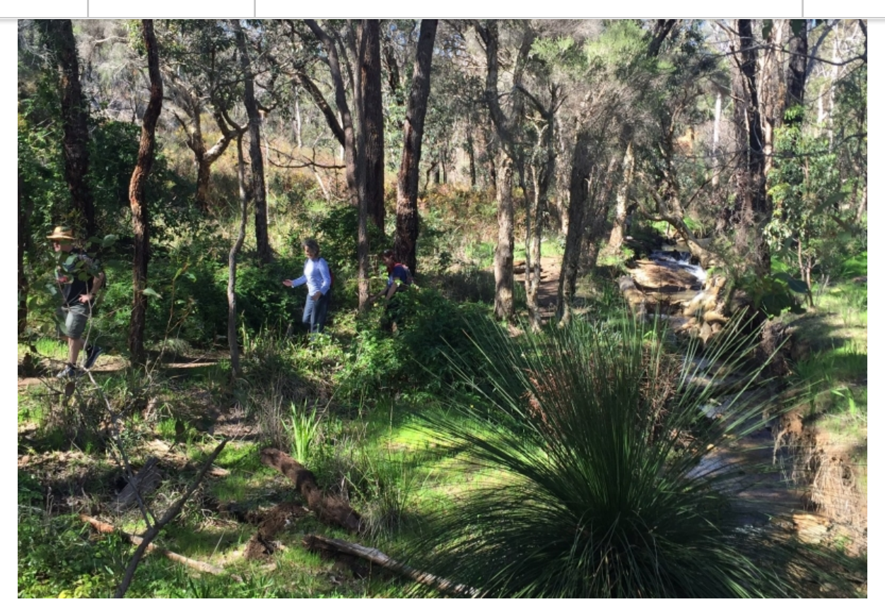
Whistlepipe Gully walk

When it comes to a destination for a walk in winter, there are unlimited choices in and around Perth. Many people flock to the gorgeous coastal trails or inner city lake walks. But what if you want to find somewhere a bit more hidden, somewhere that feels like a well-kept secret there for just you to enjoy?