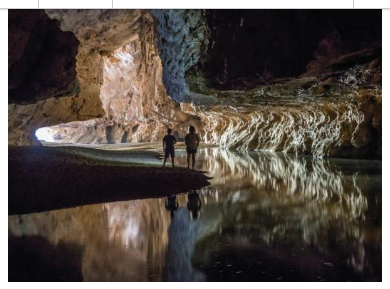
Tunnel Creek National Park

Tunnel Creek National Park is around 91 hectares, north west of Fitzroy Crossing. It includes Western Australia's oldest cave system, famously used as a hideout late last century by an Aboriginal leader known as Jandamarra.