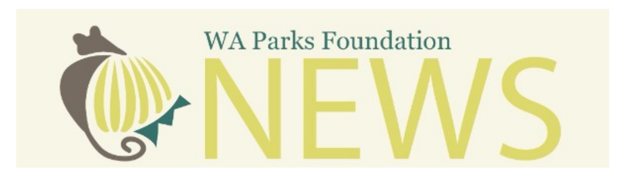
Special Edition | Spring 2018