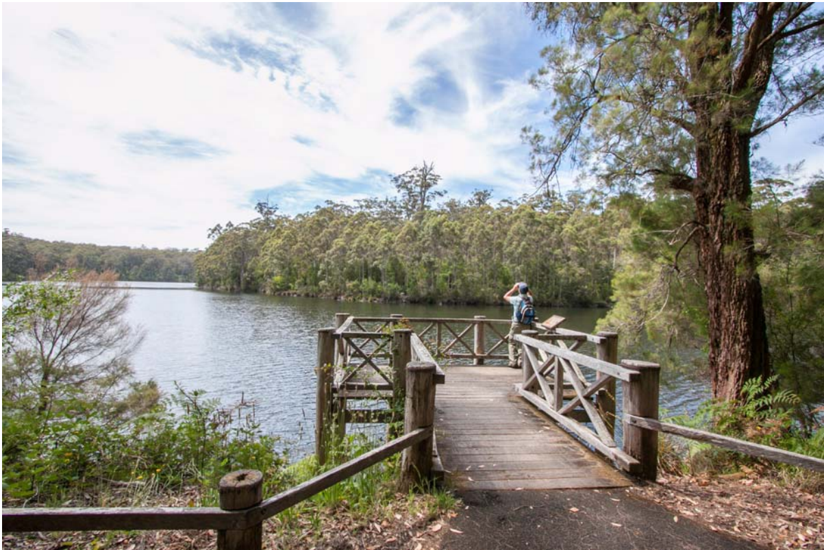
Big Brook Dam and Arboretum in Pemberton, a great place to swim, kayak, hike, camp and birdwatch