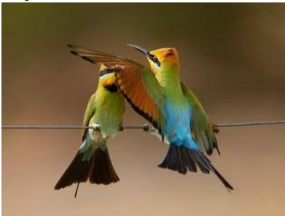
Rainbow Bee-eaters