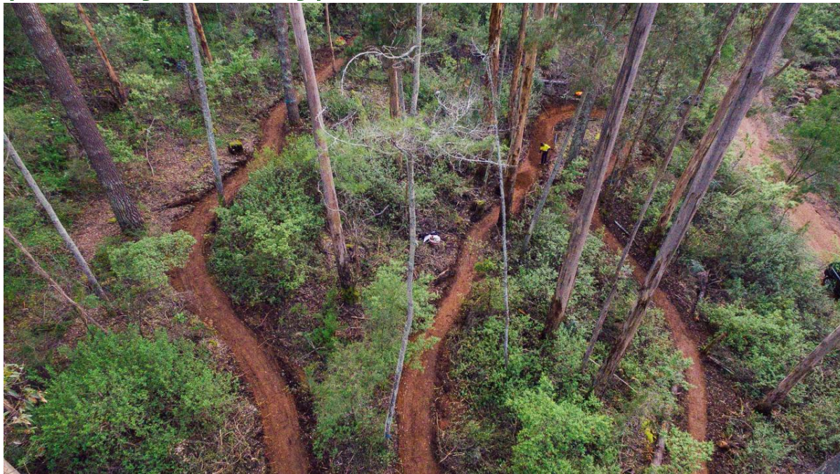
Wooditjup National Park

Surrounding the popular South West town of Margaret River, Wooditjup National Park provides visitors with stunning forest areas as well as a plethora of ways to enjoy the natural environment. The national park is home to a number of native species including western ringtail possums ( Pseudocheirus occidentalis ), brush-tailed phascogales ( Phascogale tapoatafa ), quenda ( Isodon obesulus ) and the endemic Margaret River hairy marron. It also provides vital habitat for Baudin's, Carnaby's and Forest Red-tailed Black Cockatoos.