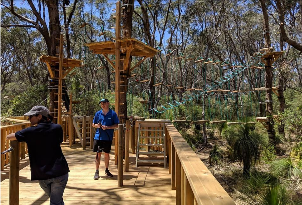
High Ropes Course Yanchep

Exercising doesn't have to be boring. A high ropes course is a great way to exercise without even realising that is what you are doing. Western Australia now has two high ropes courses as a way to have fun and engage in a fitness activity in a national park. Located in Lane Poole Reserve and newly opened in Yanchep National Park, Trees Adventure provides outdoor excitement for the entire family.