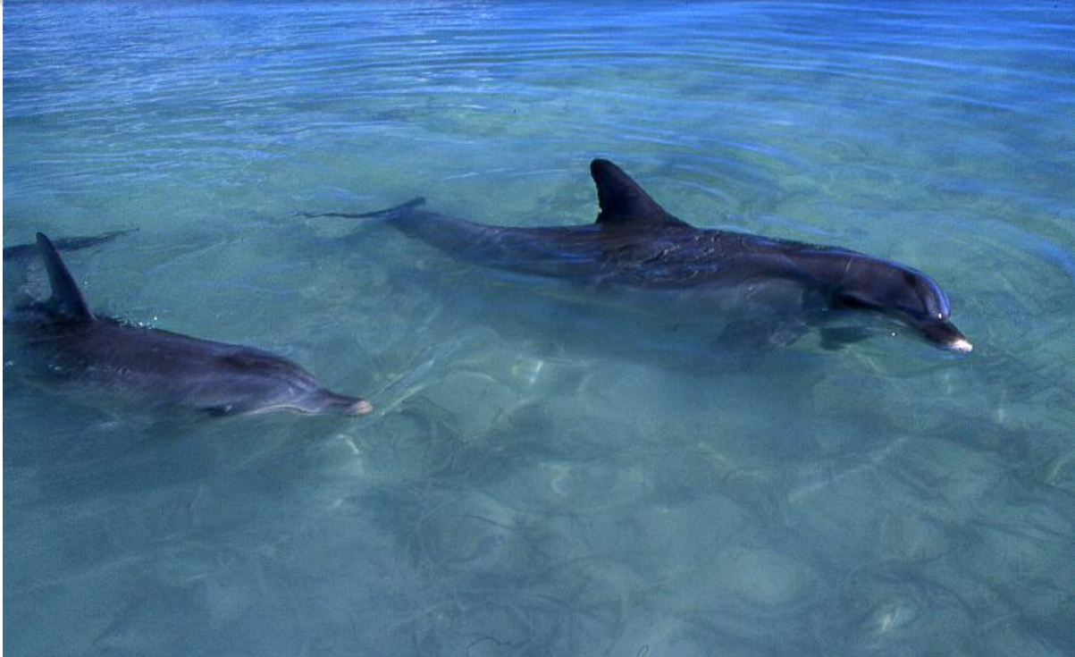
Interact with Dolphins at Monkey Mia, Shark Bay World Heritage Area

Western Australia has many spectacular nature-based activities and wildlife viewing is high on the list. Migration patterns mean that not all wildlife is easily accessible year-round. Just in time for the school holidays, we have compiled a list of the best marine wildlife interaction opportunities for December. Click the links to see the details.