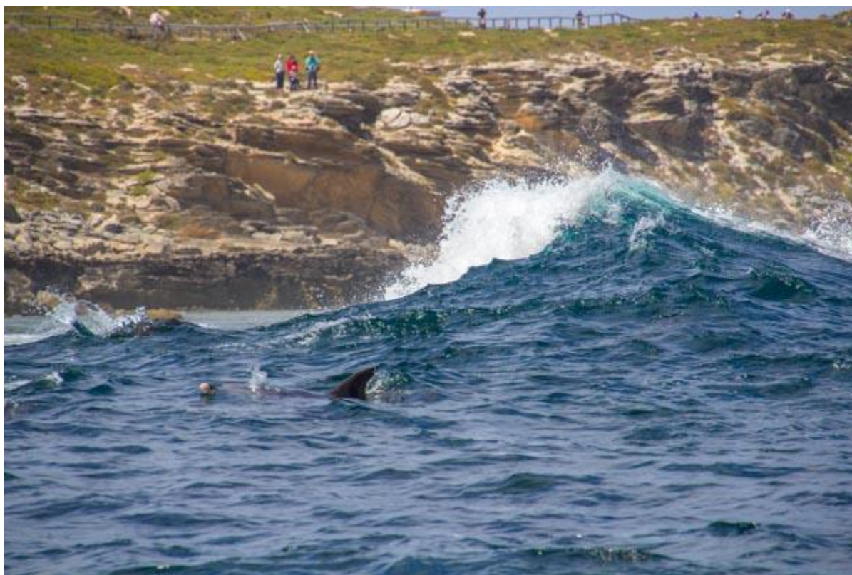
Dolphins surfing the waves at Rottneet Island's West End Lookout

Welcome to the WA Parks Foundation News, sharing news and events that celebrate Our WA Parks and helping to increase community appreciation and involvement in the stewardship of our incredible national parks and conservation estate.