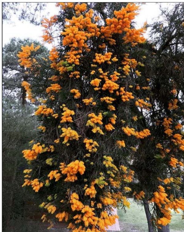
The Western Australia Christmas tree.

Nuytsia florabunda.