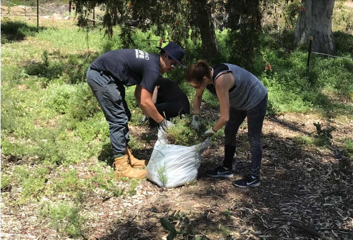
Deloitte volunteers helping with weed removal.

Impact Day is always a special day on the Deloitte Australia calendar. Held in November, each year thousands of Deloitte employees around the country down their usual work tools to make a positive contribution to the community.