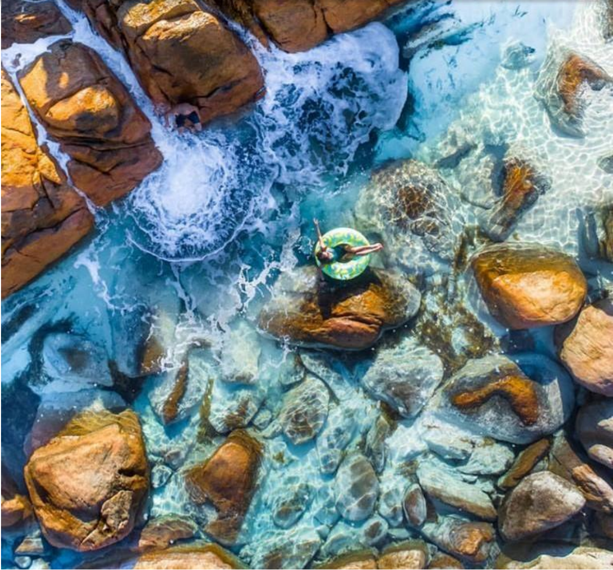
Picture: Injidup Natural Spa, @Airloft via Australia's South West on Instagram

Is getting outdoors more often one of your new year's resolutions?