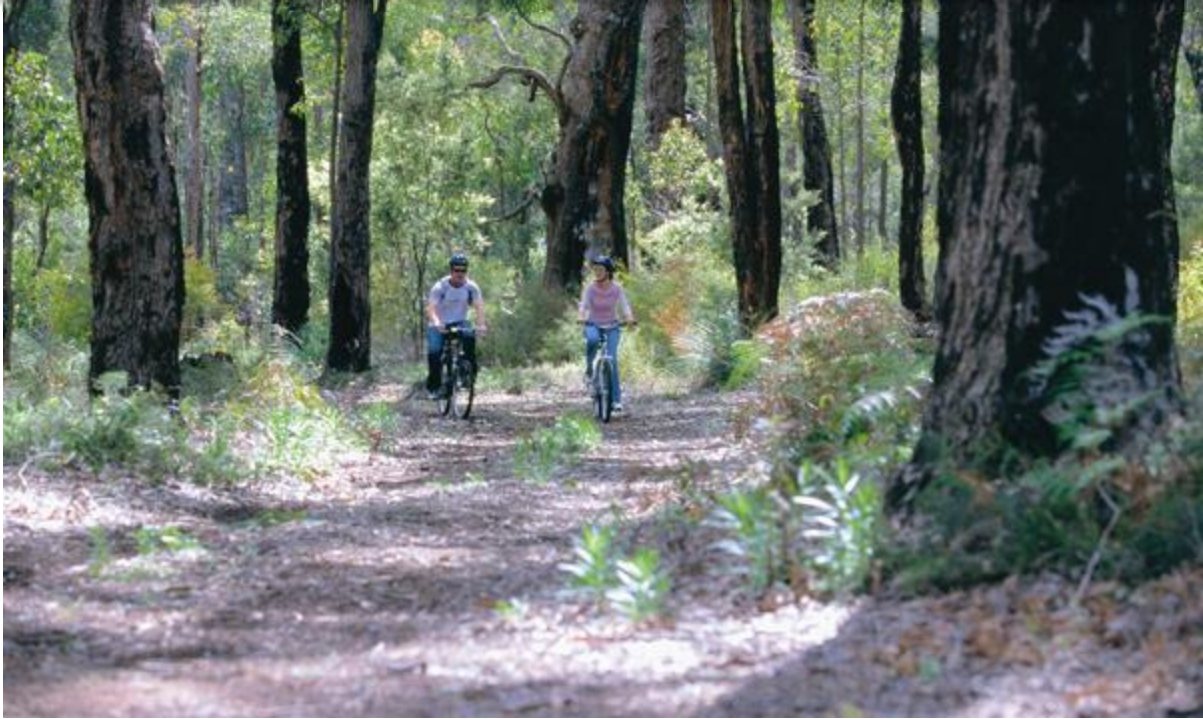
Picture: Wellington National Park

Department of Biodiversity, Conservation and Attractions has announced that a new world-class walk trail has been opened in Wellington National Park, near Collie, as part of the State Government's commitment to improve visitor facilities in the Collie-Preston area. The new 20-kilometre Wilman Bilya Trail stretches from Wellington Dam north to the Coalfields Highway, winding through magnificent blackbutt, open jarrah forest and past granite outcrops.