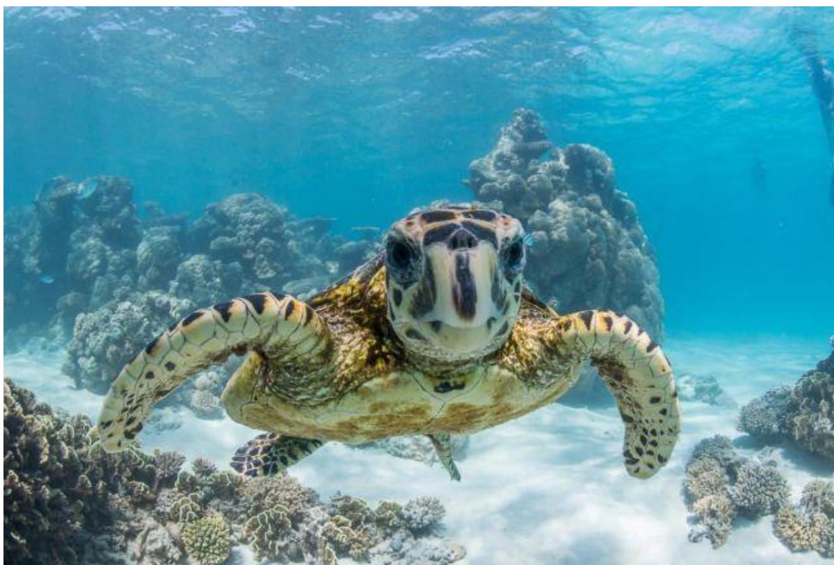
Turtle swimming in the colourful coral gardens at Ningaloo Marine Park

Welcome to the WA Parks Foundation News, sharing news and events that celebrate Our WA Parks and helping to increase community appreciation and involvement in the stewardship of our incredible national parks and conservation estate.