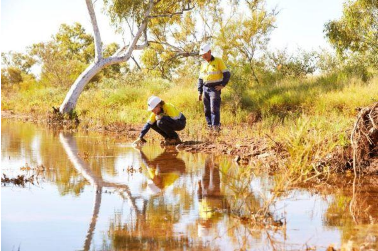
Picture: Environment monitoring takes place near Fortescue's Cloudbreak mine site.

Fortescue Metals Group's (Fortescue's) Green Team initiative provides a unique volunteering opportunity for its workforce to participate in environmental monitoring activities in the Pilbara. Fortescue, a WA Parks Foundation Founding Partner, is committed to safeguarding the environment for future generations. It is focused on protecting biodiversity, managing water resources responsibly, reducing greenhouse gas emissions and managing waste.