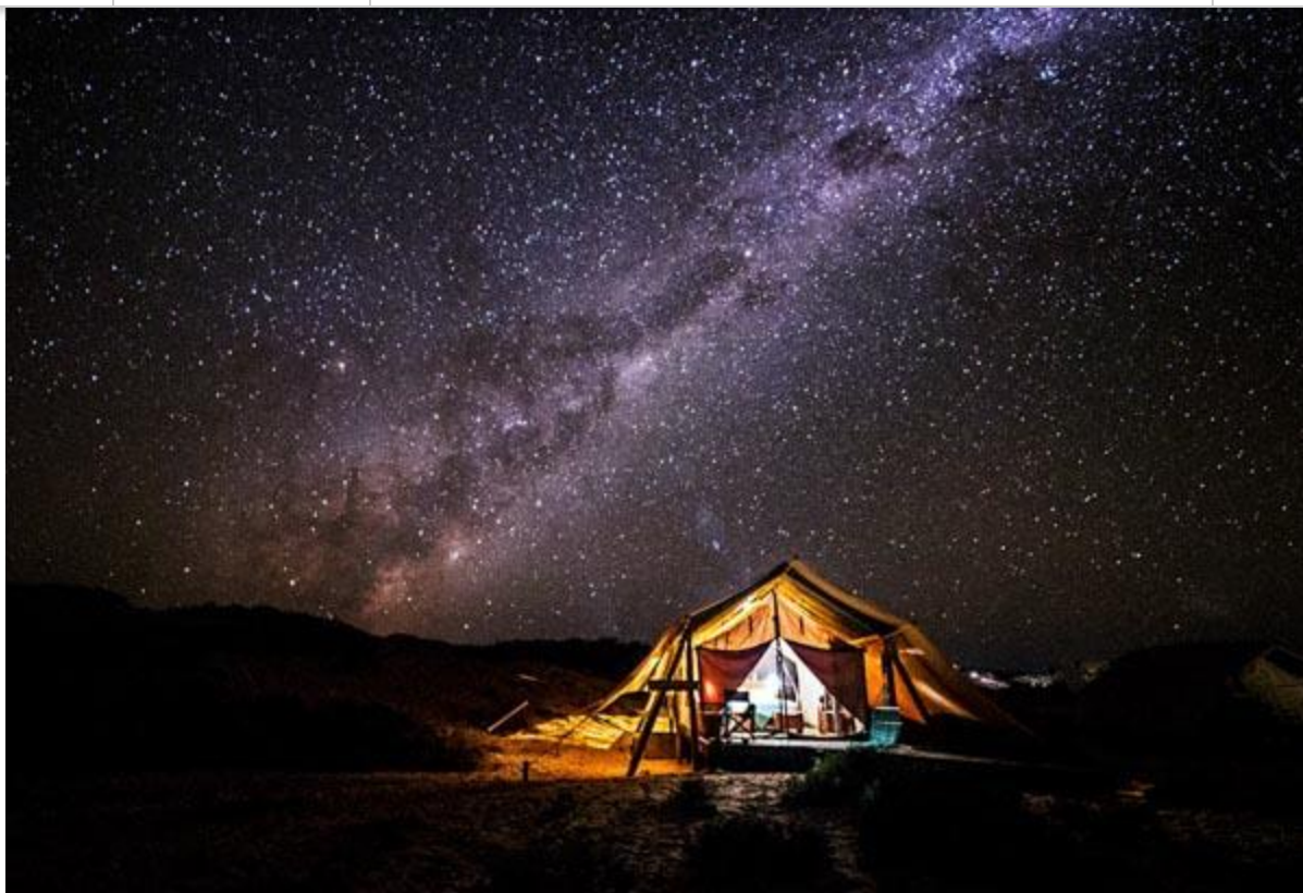
Picture: Milky Way, Sal Salis Ningaloo Reef

A recent report by the Department of Biodiversity, Conservation and Attractions shows that more people are visiting our parks. WA national parks and reserves had 20.39 million visits in 2017–18, with a visitor satisfaction level of 92.5 per cent.