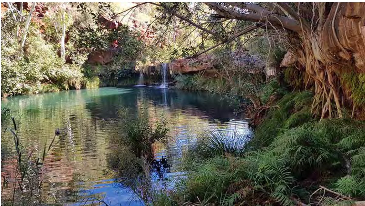
Picture: Fern Pool, Karijini National Park

Welcome to the WA Parks Foundation News, sharing news and events that celebrate Our WA Parks and helping to increase community appreciation and involvement in the stewardship of our incredible national parks and conservation estate.