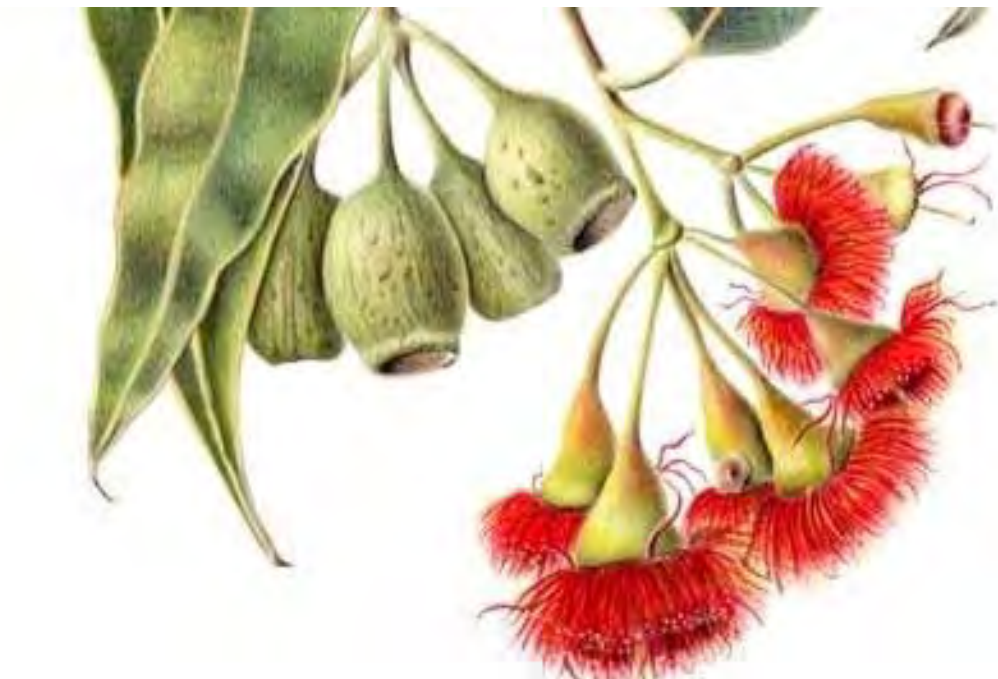
Picture: Red Flowering Gum (Corymbia ficifolia), by Jacqueline Pemberton

Congratulations are due to our good friends at FACET (Forum Advocating Cultural and Eco Tourism) on the success of their recent Wildflower Workshop at Frasers State Reception Centre, Kings Park.