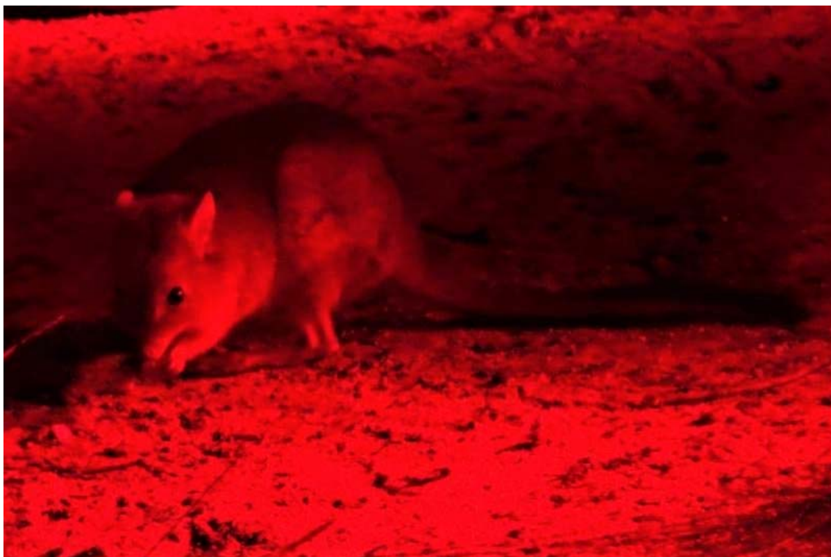
Picture: Nocturnal forager at Barna Mia

Situated in the heart of the Dryandra Woodland about 170 kms south-east of Perth, the predator proofed Barna Mia is a place to discover threatened native marsupials in a natural setting.