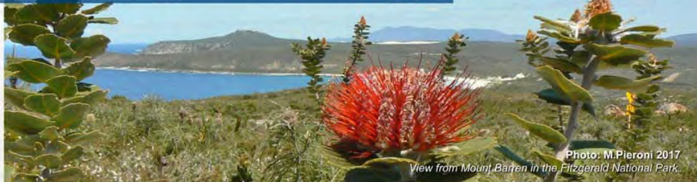
Photo: M. Pieroni 2017 View from Mount Barren in the Fitzgerald National Park.

The Wildflower Society of Western Australia will host the 2019 Blooming Biodiversity Conference in Albany from 29 September to 4 October.