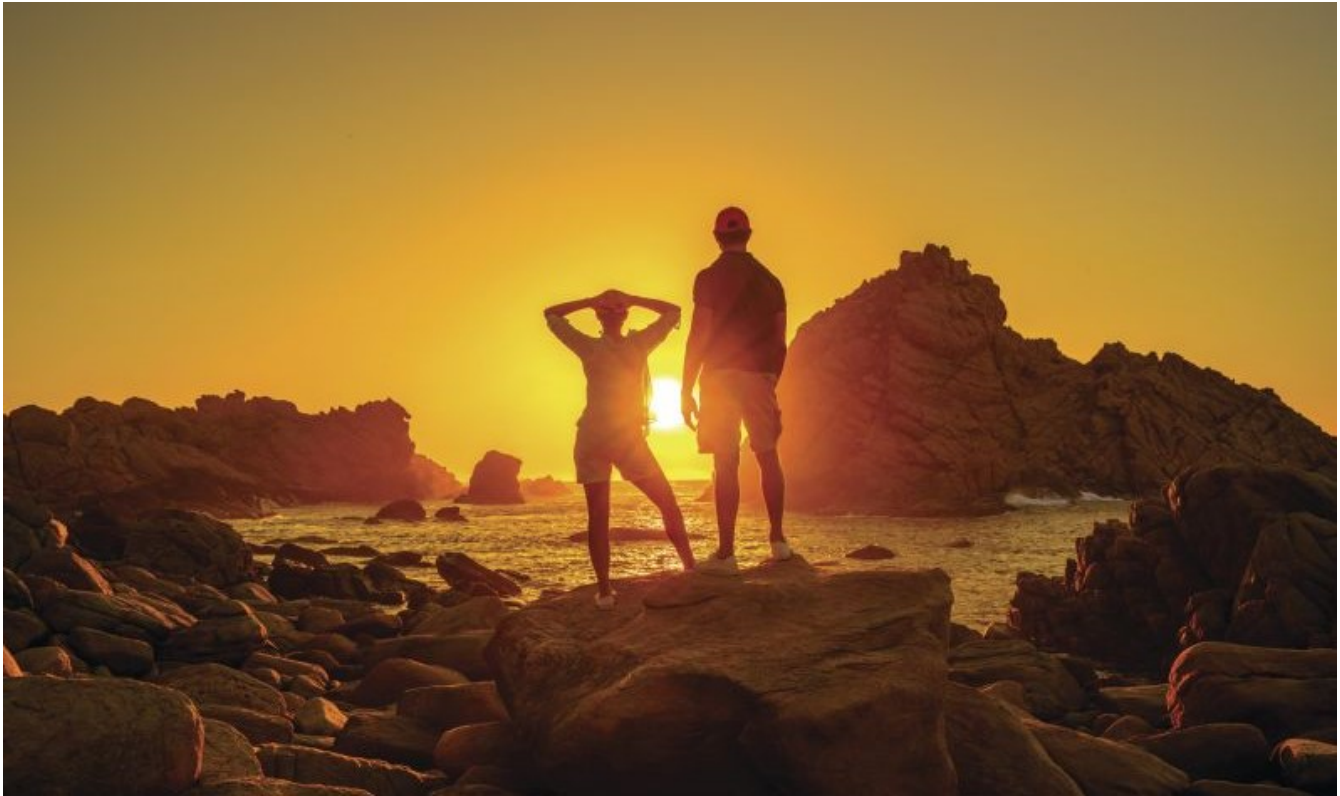
Picture: Sugarloaf Rock, Leeuwin-Naturaliste National Park | Tourism WA

There is positive news on international holiday visitation in the latest figures released by Tourism Research Australia.