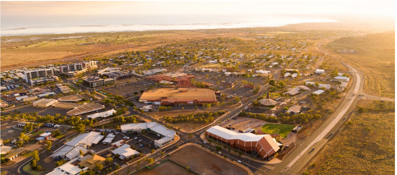
Picture: Aerial view of Karratha, WA

Karratha is the host city for this year's WA Regional Tourism Conference to be held from 16-18 September.