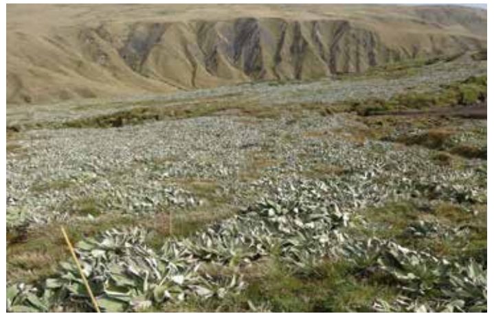
LEFT: Grazing and burrowing rabbits removed vegetation resulting in substantial landslipping and erosion. RIGHT: Macquarie Island megaherb (dominated by Pleurophyllum hookeri ), is now recovering following the eradication of the rabbits.

$24.8 million (that also included targeted follow-up hunting). It was the largest, most ambitious and most expensive multi-species vertebrate eradication program ever attempted in Australia. (The eradication was jointly funded by the Australian and Tasmanian state governments. Logistic support was provided by the Australian Antarctic Division.)