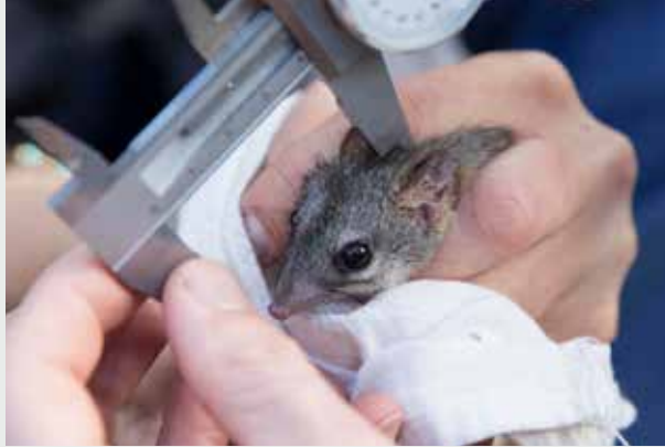
A red-tailed phascogale gets measured.

4. Testing different survey methods: including live trapping, transect surveys, camera trapping and genetic mark-recapture from scats, in order to develop robust, cost-effective monitoring protocols.