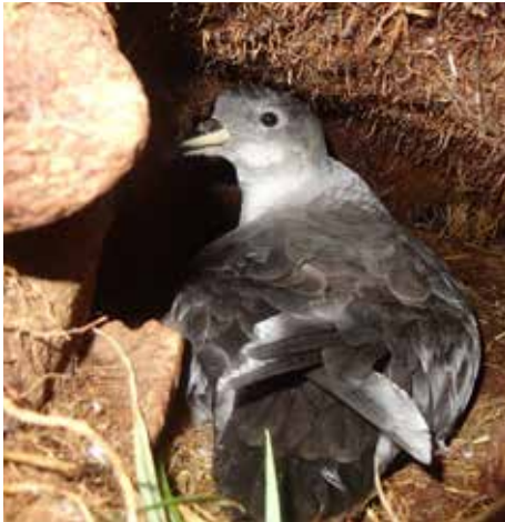
Grey petrel numbers are increasing following the removal of vertebrate pests.

Since the 1970s rabbits were controlled through the introduction and continued deployment of the myxomatosis virus. Feral cats were eradicated from Macquarie in 2000 but it was always acknowledged this partial solution wasn't enough. The motivation for cat eradication at the time was to ensure that burrowing petrel species did not go extinct on the island, which was achieved. Rabbits, rats and mice remained on the island. The rabbit population went through another explosion in the 2000s, due most likely to the eradication of cats, a reduction in the efficacy of myxo and vegetation recovery due to previous myxo success. The big breakthrough came with the successful eradication of rabbits, rats and mice in a program that commenced in 2013 through a large-scale aerial baiting program that cost