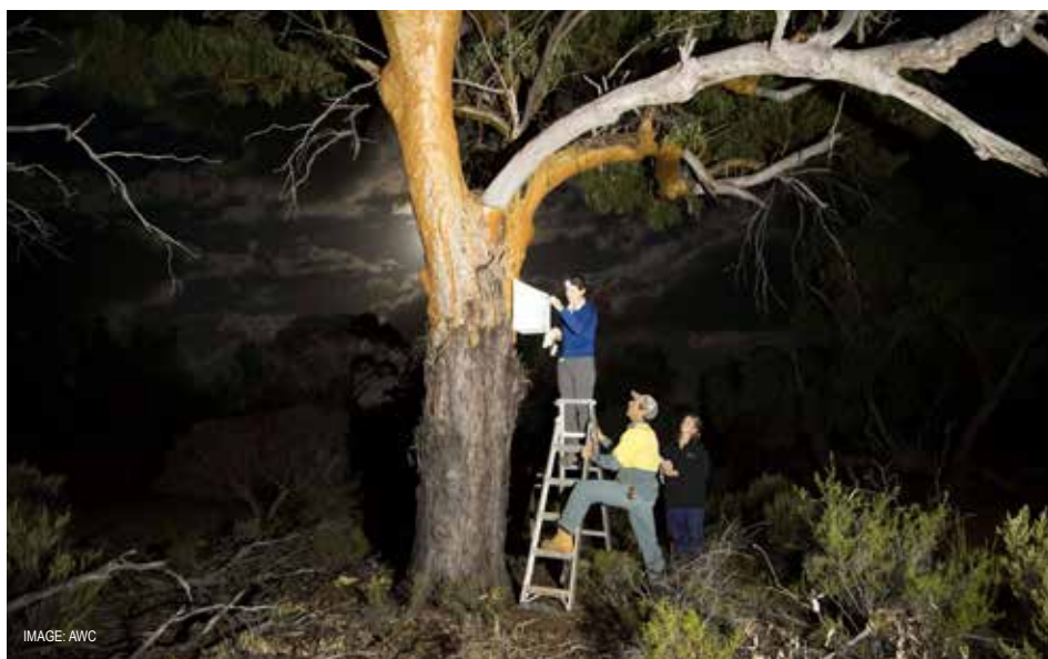
Releasing a red-tailed phascogale into a nest box in the still of the night.

Research is fundamental to the success of these ventures; we have so much to learn. In some cases we are seeing species back in environments where they have not been in for a long time. This is when you might observe ‘new’ behaviours (eg, animals making use of habitats that they are currently not associated with). Anything we can do to improve the success of future translocations and to provide information that assists these activities is worth the effort.