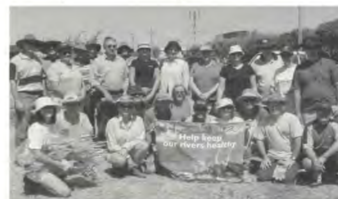
Volunteers from Challenge Bank Loans Division.

healthy’ by participating in the event as part of their company’s worldwide community initiative Global Impact Day (GID).