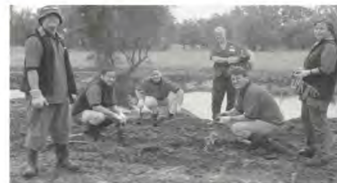
Volunteers from Deloitte Consulting.

More than 26 Deloitte Consulting volunteers ‘helped to keep our rivers