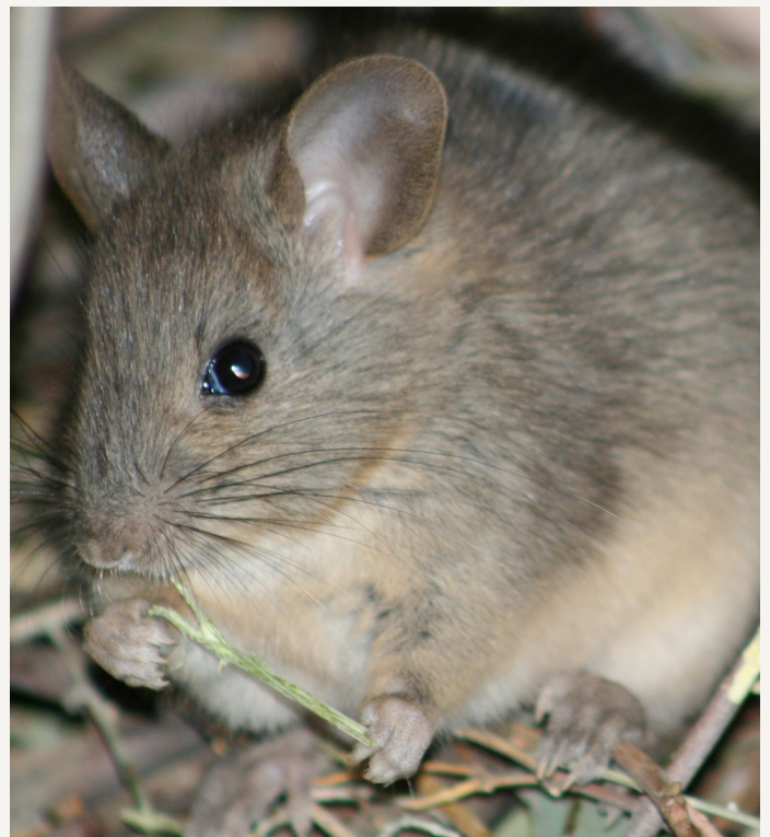
Above Greater stick-nest rats will be reintroduced to Dirk Hartog Island National Park in May this year.

Once the radio collar trial is complete, our “Adam and Eve” will join other recruits from Salutation Island in late May for their island escape. They’ll be accompanied by piles of sticks and woody debris or ‘proto-nests’ to build their new homes to ensure they have the best start in their new life on Dirk Hartog Island National Park.