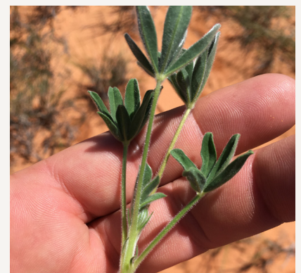
Above Lupin seed can last 20 years in the soil!

Scan the QR code above to find the island protection brochure to prevent bringing any 'space invaders' on your next island holiday.