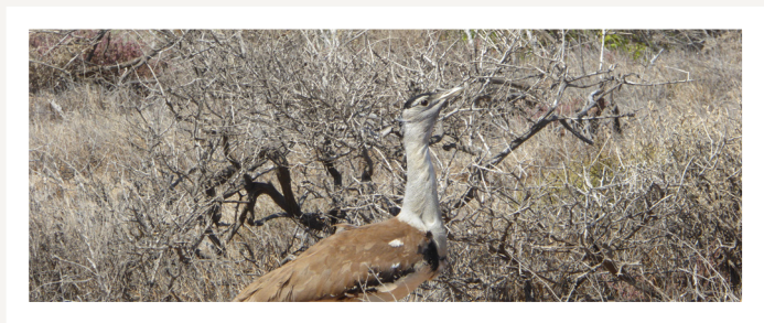
Above Sightings of ground dwelling birds like this Australian bustard are on the rise.

There are many factors that can contribute to increased sightings of ground dwelling birds, such as the flourishing vegetation that follows good rainfall, so it's still early days. However, increasing sightings of ground dwelling birds are an exciting change and may be a sign of their recovery as a result of the Return to 1616 Ecological Restoration Project.