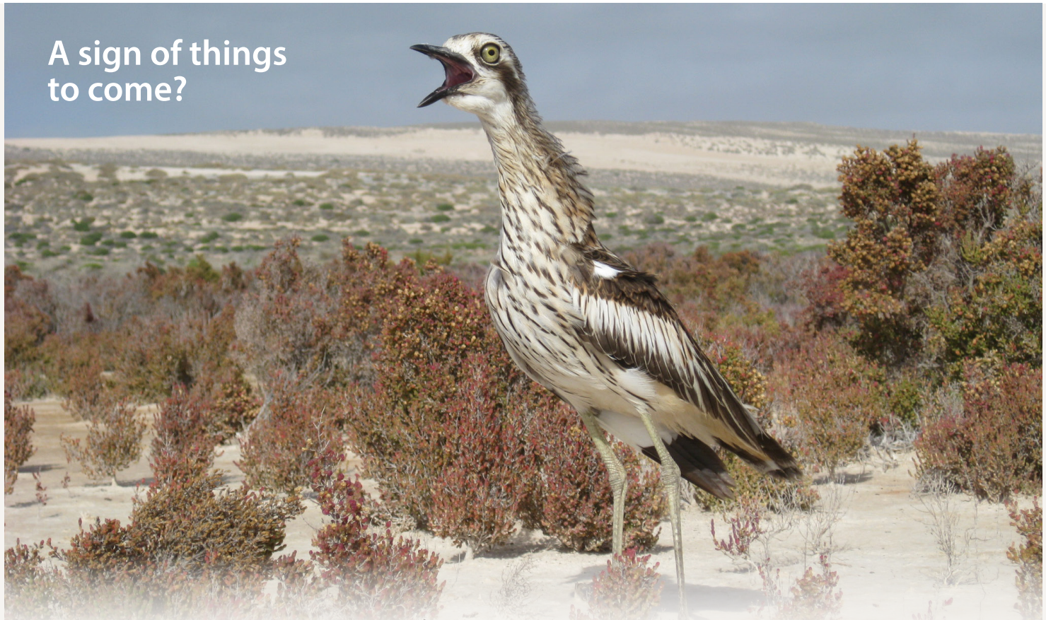
Above What! Feral cats are gone? A bush stone curlew poses for a photograph.

This bush stone-curlew ( Burhinus grallarius ) seemed in a mood for a photo shoot and its sighting was an early Christmas present for DBCA staff last December on Dirk Hartog Island National Park. Scattered records of bush stone-curlews on the island date back about 100 years and although this is only a single occurrence, more and more sightings of ground dwelling birds are being noticed by DBCA staff and anecdotal evidence is mounting to suggest their numbers are on the rise.