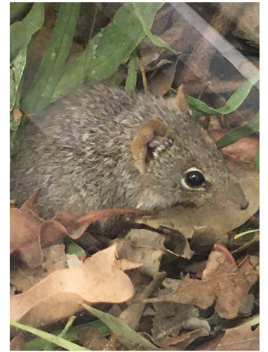
Above Dabbler.

More translocations are planned in the future in order to boost population numbers, so stay tuned for more dabbler news!