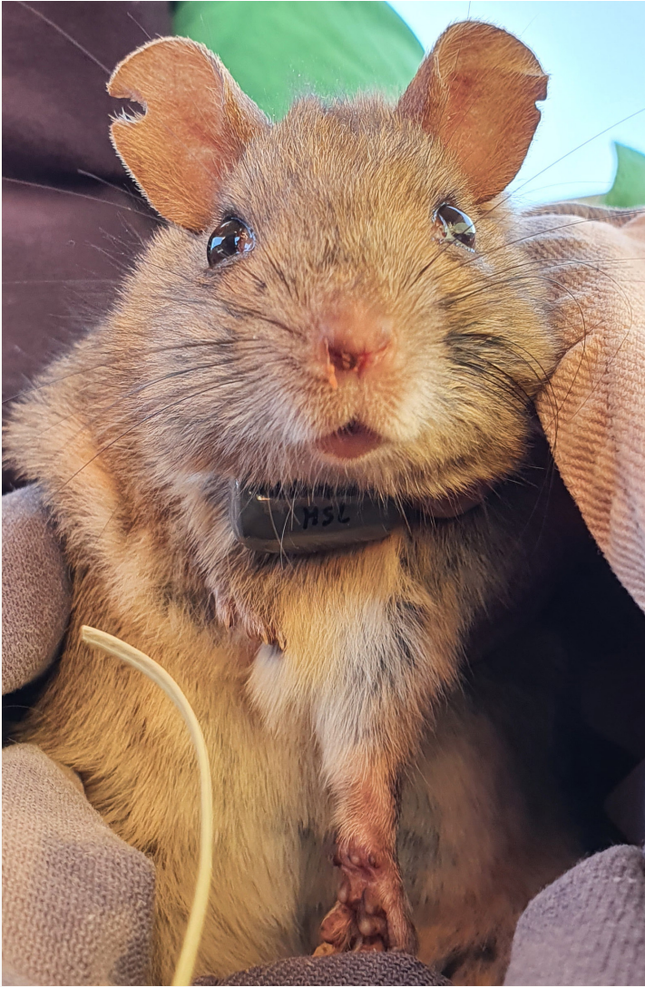
Above Radio collars are in fashion this season. A radio collar trial is currently determining the best fit for greater stick-nest rats to ensure the success of their relocation to the park.