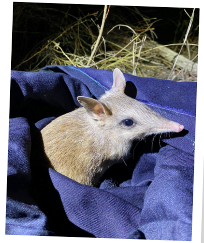
Above right It was an exciting moment watching the bandicoots take their first steps in their new home.

Since their reintroduction, careful monitoring of the newest inhabitants of Pilliga has revealed that they are settling in well and doing what Shark Bay bandicoots do best when given the opportunity ..... breeding! All of which bodes well for a bright future.