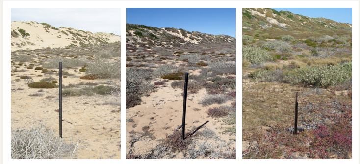
Below This series of photos taken between 2007 and 2022 show vegetation changes at the same location, before and after the removal of feral goats and sheep.