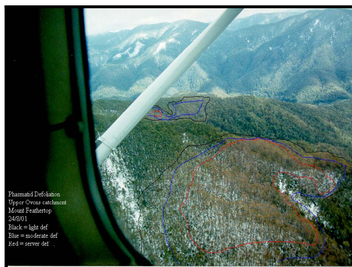
Figure 4. Phasmatid defoliation in Eucalyptus delegatensis , north east Victoria 2001-2002.