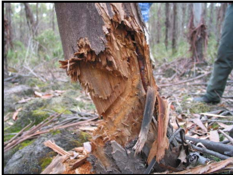
Figure 3. Cockatoo damage to Eucalyptus saligna in search of cossid moth larvae, Gippsland.

Victoria: Minor damage to E. saligna and E. globulus plantations in Gippsland has again been observed by cockatoos pulling off bark and wood on trees in search of cossid moth and longicorn larvae (Figure 3). Damaged trees are subsequently blown over by wind gusts.