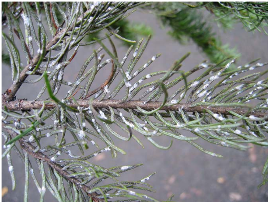
Figure 1. White cottony tufts associated with Adelges cooleyi , and Phacryptogus gaeumannii , on Douglas fir from Bago State Forest.

Adelges cooleyi was observed in significant numbers on Douglas fir in Bago State Forest in mid-2003, on the majority of trees where foliage could be observed (ie. younger trees or roadside trees). Damage was significant on young wildlings, with over 25% severity including copious sooty mould, and on older needles of older trees. Damage appeared to be more severe than in previous years.