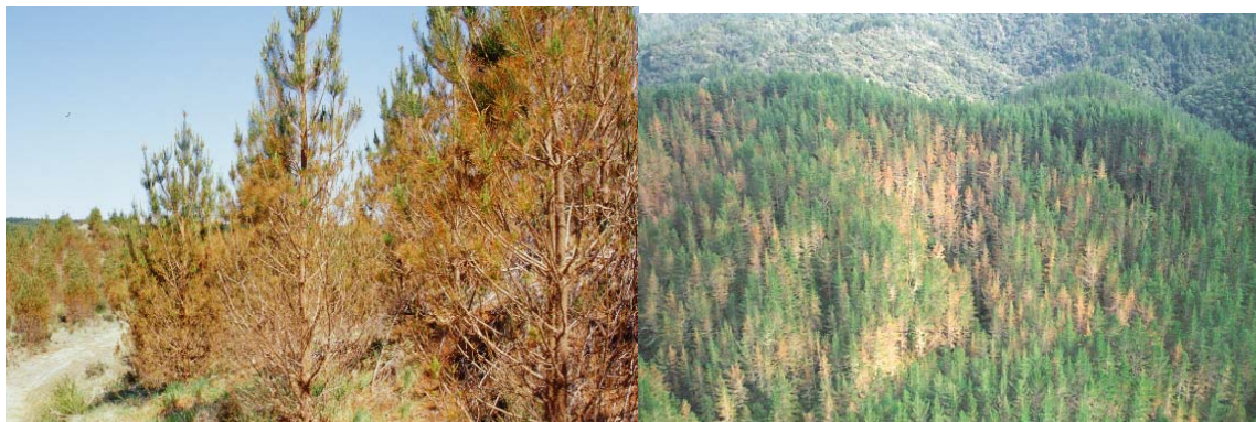
Figure 8. Severe defoliation caused by an increase in Dothistroma septosporum infection after two consecutive wet summers (taken late 2002).

defoliation was also severe in Coromandel, an area where this disorder has rarely been recorded. June and July 2002 rainfall was over 200% and 125% of normal, respectively, in this region. No defoliation was apparent in the East Cape where it was drier than average in June and July.