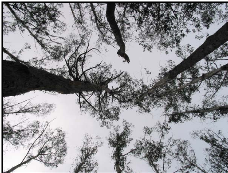
Figure 5. Canopy image of Eucalyptus delegatensis defoliated by Chrysophtharta agricola , north east Victoria, 2002.

Cardiaspina retator (Red gum basket lerp): Infestations of E. camaldulensis by the Red gum basket lerp Cardiaspina retator have been observed in northern Victoria alongside roads and riverbanks, with damage most evident during early to mid summer 2002-2003. While defoliation had been severe in certain localities, by the following autumn, trees had generally made a full recovery.