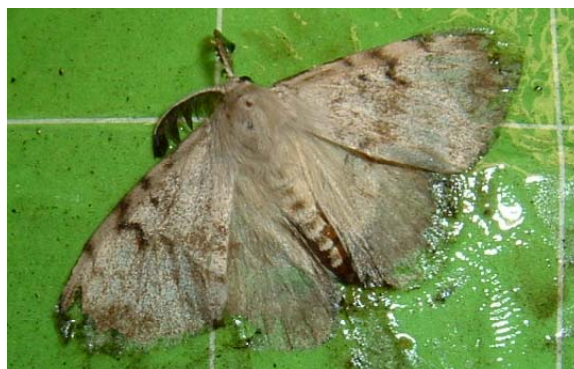
Figure 10. A single male moth of Lymantria dispar ssp. Praeterea trapped in Hamilton on 26 March 2003 (distance between wingtips, 47 mm)

http://www.maf.govt.nz/biosecurity/pests-diseases/forests/gypsy-moth/index.htm