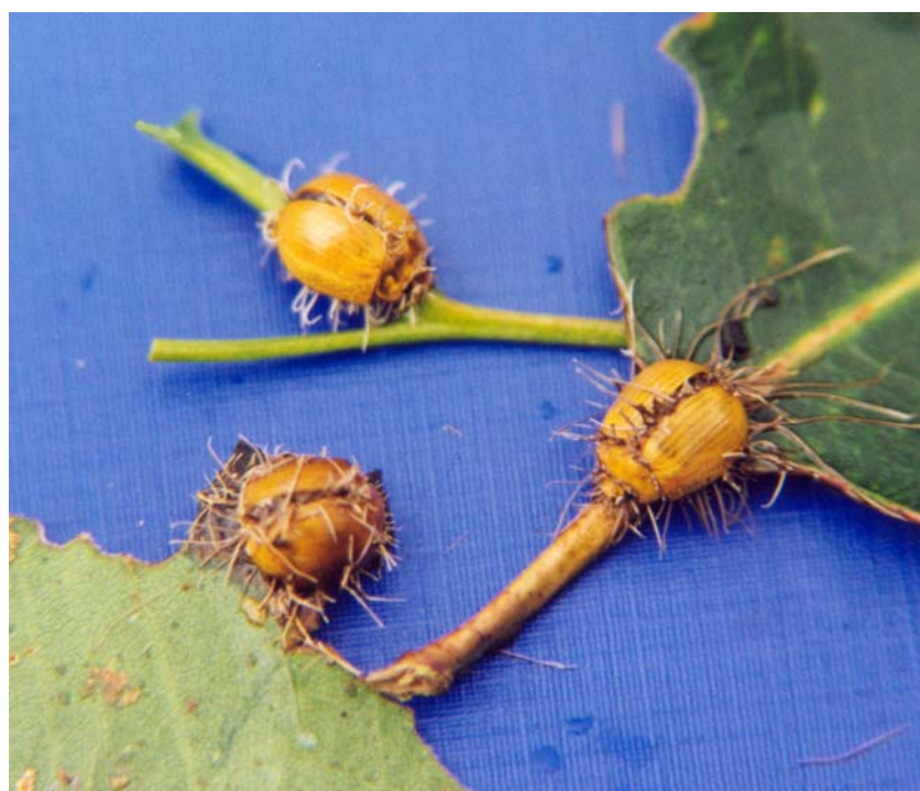
Figure 2. Entomogenous fungus growing out of Chrysophtharta cloelia on E. grandis in northern NSW

New South Wales: There was generally only low to moderate levels of damage from chrysomelids in 2002-2003. However, several plantations experienced higher levels of damage from P. atomaria . Several years ago an entomogenous fungus was observed infecting C. cloelia in an E. grandis plantation in northern NSW during regular forest health surveys (Figure 2). More collections have recently been made from C. cloelia and P. atomaria , on E. grandis , E. dunnii and E. cloeziana , now from 3 separate plantations. The fungal species involved is being investigated.