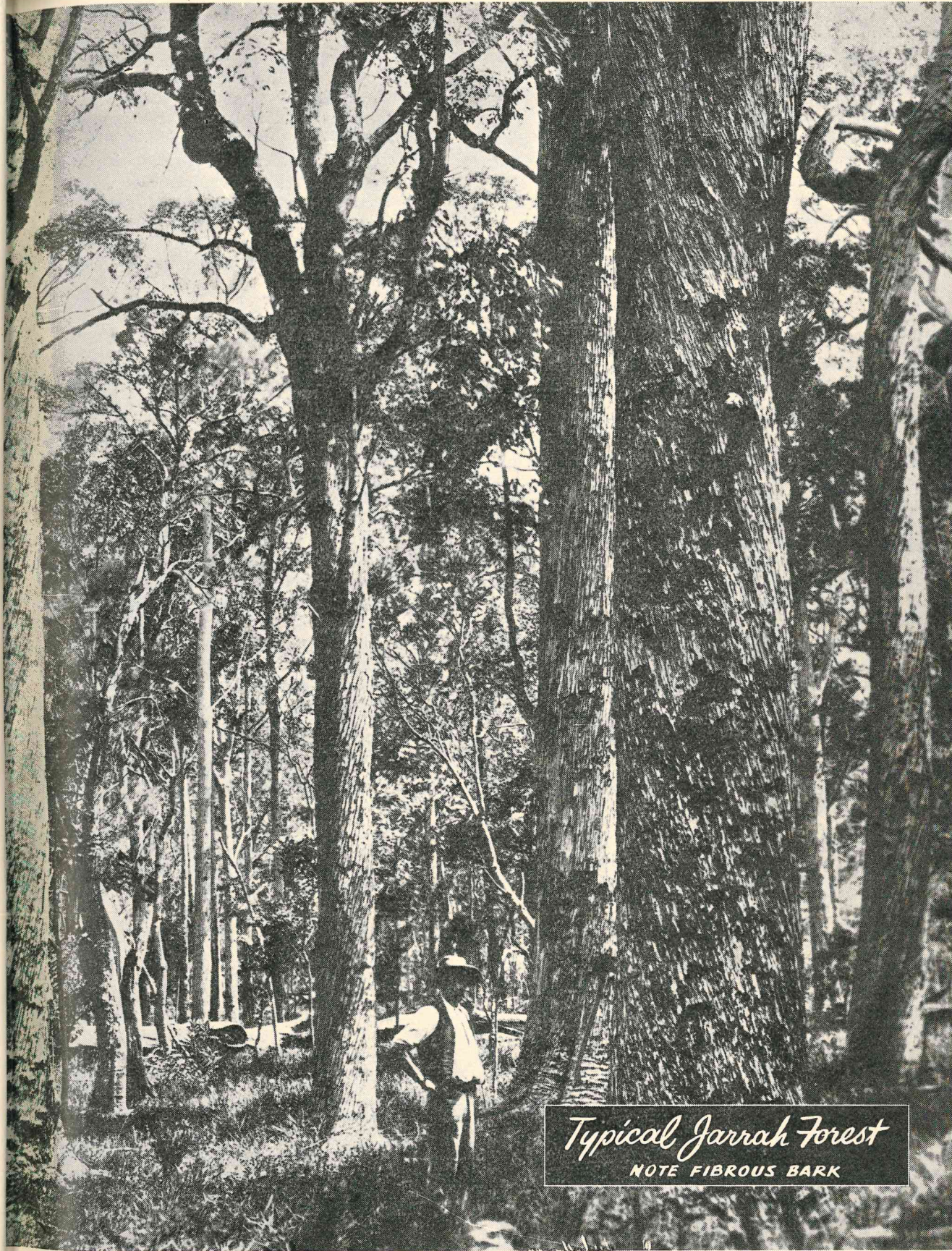
Typical Jarrah Forest NOTE FIBROUS BARK