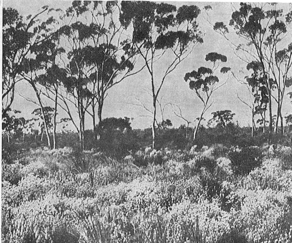
Typical Eucalyptus woodland of the Eastern Goldfields, with masses of mulla mulla and everlastings

( L. macrantha ), Dampiera , Mallophora , Ptilotus (mulla mulla) and Logania .