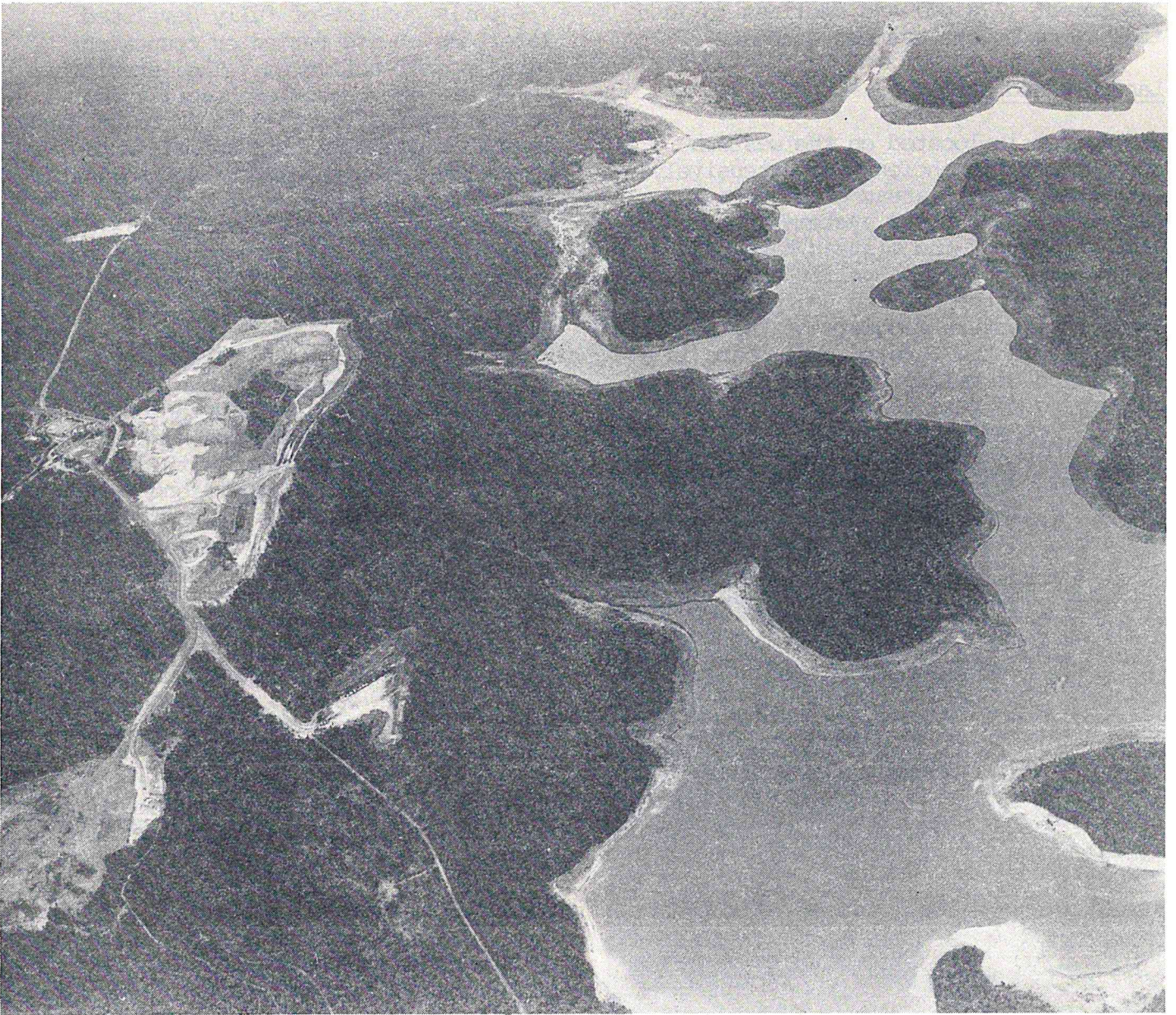
Figure 2 - Aerial view of bauxite mines and water reservoir within the jarrah forest.

adapted to the environment (Shea and others 1975). Between 31 and 133 kilograms of salt per hectare are deposited annually in rainfall in the forest (Peck and Hurtle 1972). In high rainfall areas or where soils are shallow, most of this salt is flushed through the soil profile. However, in approximately two-thirds of the forest, there is a net accumulation of salt. This is a consequence of the ability of the vegetation to maintain transpiration rates approximating the potential rate throughout the year.