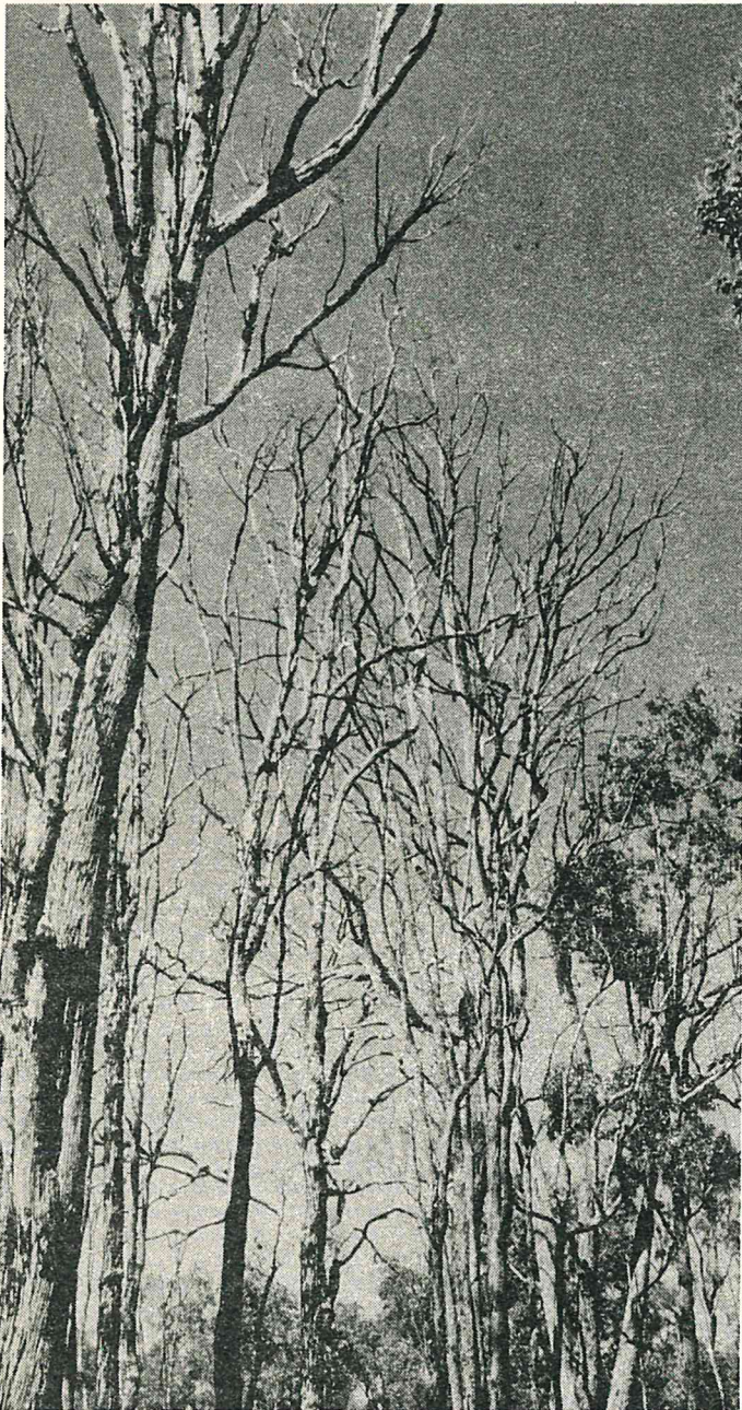
Figure 2 - Jarrah Dieback, a disease caused by the soil-borne fungus Phytophthora cinnamomi .

The forest is located on the western boundary of the ancient and extensively laterized Great Plateau of Western Australia. The river systems in the western edge of the plateau have been rejuvenated following uplift and formation of the Darling Scarp which forms the western boundary of the forest. Thus, within the forest zone, there is a succession of valley types characterized by varying degrees of incision.