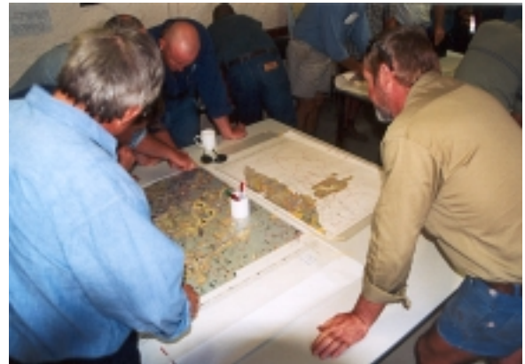
Landholders mapping key target areas for aerial baiting campaigns.

Ample proof exists showing just how effective aerial baiting can be when carried out properly.