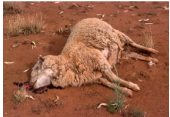
Sheep killed by wild dogs and left uneaten.

Unless tracks can be individually recognised, which even the most experienced doggers rarely claim, other signs such as scats containing wool have to be used. This has several problems. Firstly, many wild dogs can cause considerable stock losses without actually eating much (or any) sheep. By way of example, over 40 dingoes were selectively shot in one study area, all targeted because of their observed killing of sheep (seen, identified, and watched from the air). Only 50 per cent actually had any identifiable sheep remains in their stomachs and only 20 per cent of scats collected from the area contained wool.