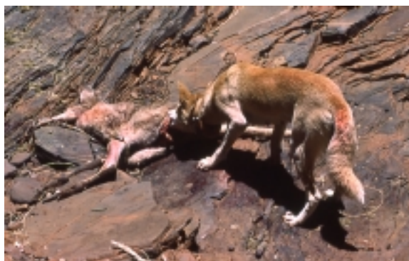
Wild dog feeding on a kangaroo.

Pack stability and separation of adjacent packs is maintained by means of visual, vocal (howling) and scent (scats and urine) cues. There is no evidence to suggest that scent-marks repel intruding individuals (that is, dogs coming into the pack territory from outside).