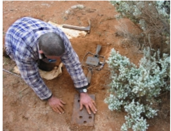
Dogger preparing trap site.

In some instances, particularly when wild dogs are operating within sheep paddocks, specialist trapping is required. A novice can be readily taught the basic mechanical skills of setting a trap, but needs to spend time with an experienced dogger to learn where to set traps and the type of sets that can be used. Incorrect placement of traps not only wastes time but also, more importantly, has the potential to create trap-shy dogs, which then often become a challenge for even the most experienced dogger.