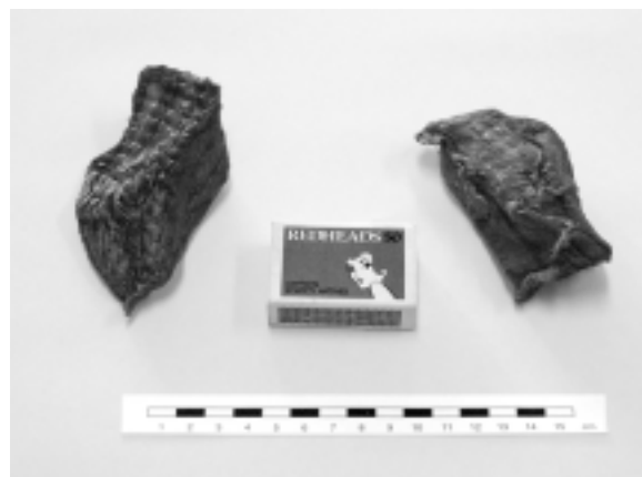
Well-prepared dried meat baits.

Despite the known effectiveness of the dried meat bait, there is some merit in having alternative bait materials. A salami type bait developed for foxes in Western Australia is expected to be tested for use against wild dogs. If it proves to be effective, the salami bait would be an additional bait, not necessarily replacing the field or factory-produced dried meat bait, and it too would be available from retailers. The salami baits would have a uniform size and weight, which means that they may be able to be aurally dropped via an automated delivery system. This would allow the navigator to have complete control of the bait-drop.