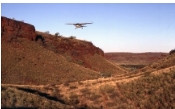
Radio tracking aircraft in the Pilbara study.

In a study of monitored dingoes with radio collars, all dingoes that ended up in sheep paddocks eventually caused losses in one way or another. This means that any wild dog in sheep paddocks will cause problems, including those that might make sheep avoid certain areas or push them through fences. It is not a good strategy to allow some wild dogs to remain immediately adjacent to a sheep area as the potential for future stock losses is simply too great.