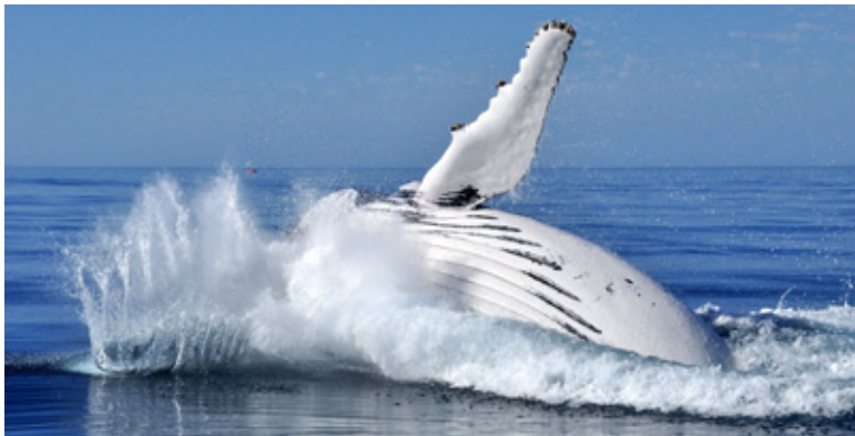
Humpback whale.

The government has provided $10 million over four years to DPaW and the Department of Fisheries for park management. It also is providing $2.2 million a year for ongoing management in the years from 2015-16.