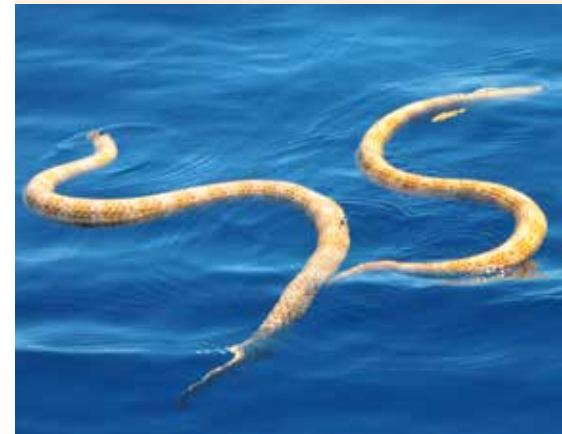
Below: Short-nosed sea snakes.

A paper detailing the findings of both discoveries was published in the journal Biological Conservation and can be viewed at www.sciencedirect.com .