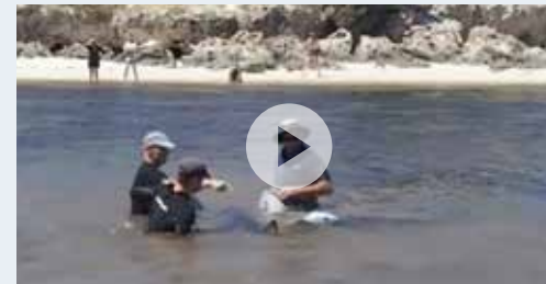
Video: The 3m Gray's beaked juvenile whale at Leeman is guided out to deeper water by Parks and Wildlife staff and volunteers. Video – Ray Worrall/Department of Fisheries

The Leeman Bay stranding was the northernmost record of this species off the Western Australian coast. It is usually found between Lancelin and Hopetoun. Gray's beaked whales are the most commonly stranded species of the beaked whales along WA's coastline.