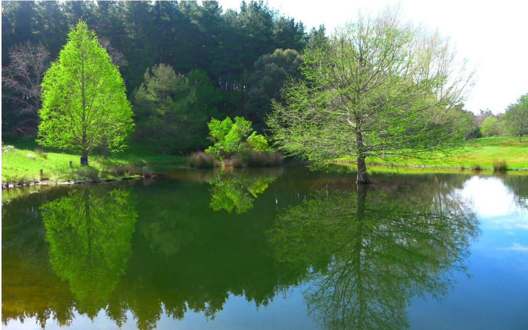
Spring leaf flush at the Duck Dam with Dawn Redwood & Swamp Cypress. (On the Sequoia Short Walk.)