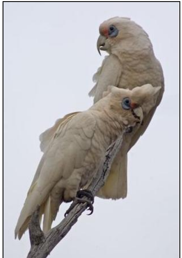
Figure 1 Muir's Corella Cacatua pastinator pastinator.

Muir's Corella feeds on corms, tubers and seeds from a variety of introduced and native plants. The corms of Guildford Grass Romulea rosea appear to be an important food item from May to November, while cereal grains such as Oats Avena sativa , Barley Hordeum vulgare , and Wheat Triticum aestivum are commonly eaten the rest of the year. Other introduced plants eaten include Storks-bill Erodium spp., and Winter Grass Poa annua . These corellas have also been recorded eating native plant species, including the bulbs of Sundews Drosera spp., the roots of 'orchidaceous plants' and seeds from Marri Corymbia calophylla , and Spear Grass Stipa spp.